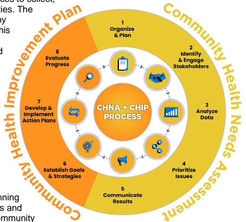
Figure 1: AHER CHNA combined process

Escambia and Santa Rosa Counties adopted a unique approach to the community health assessment (Figure 1) by combining resources to collect, assess and address problems in both counties. The process was directed by the Achieve Healthy EscaRosa collective impact organization. This organization relies on a diverse group of community partners from both counties. Led by representatives from our community's non-profit hospitals and University, with technical assistance from the Florida Department of Health in both counties, Achieve Healthy EscaRosa partners worked together to identify the resources and capacity of the community for impacting the identified significant needs from the 2022 Community Health Needs Assessment.