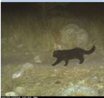
Domestic cat on a motion-activated camera.

Domestic cats and wild cats that share the same outdoor areas in urban environments can share diseases such as Bartonellosis and Toxoplasmosis that can also be spread to people.