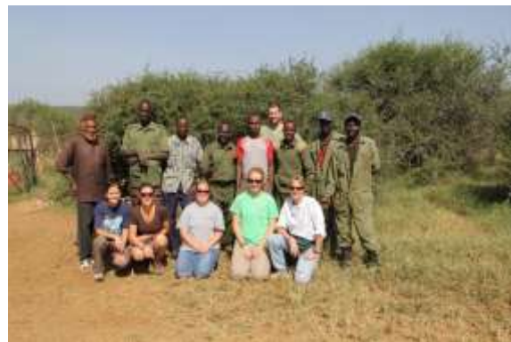
Kenyan nationals and international students work on a zoo-led camel study in Kenya to better understand disease threats at the camel-wildlife-human interface.

Until recently, conservation of biodiversity emphasized the discovery of vertebrate species with lesser emphasis on invertebrate and parasite species. The metagenomic nature of individuals, composed of their own gene complements and those of all their associated microbes, is now appreciated for humans and other animals. Each species, in fact each individual, is known to have unique microbiomes. Zoos, with collections of animals and a global footprint of projects working with free-living wildlife populations, offer the discovery of life forms down to the microbial level.