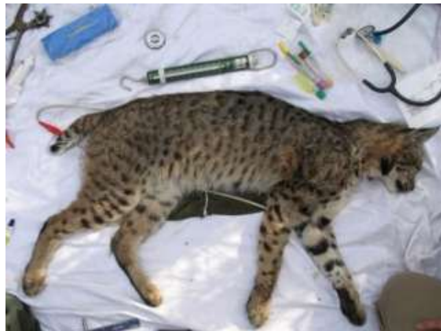
Photographing the spot pattern of a bobcat to help identify individual bobcats.

The project also looked at whether bobcats in southern California were segregated into different populations by major highways. By analyzing genetic and pathogen data, the scientists found that bobcats west or east of Highway 5 near Los Angeles rarely interbreed, but that the bobcats did cross into each other's territory often enough to share diseases such as FIV.