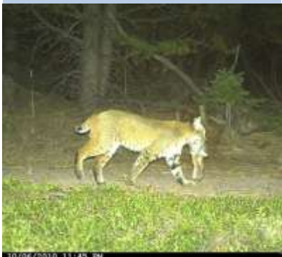
Bobcat with cottontail rabbit on a motion-activated camera at the Colorado Front Range.

The researchers followed wild and domestic cats in several regions of Colorado and California to determine whether the cats had been exposed to certain diseases. The effort includes data from 800 blood samples from felines of all sizes, including 260 bobcats and 200 pumas, which were captured and released, and 275 domestic cats. "As human development encroaches on natural habitat,