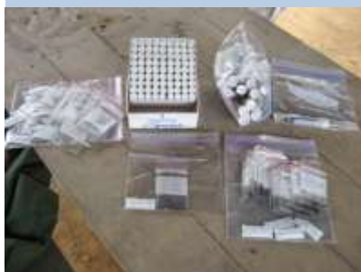
Collected hair, skin, and fecal samples ready for processing.

By capturing the lemurs, we can conduct health evaluations on a number of different species within their appropriate habitats. When evaluating the lemur individual, we assess the general body condition of the lemur (teeth, coat, eyes, ears) and also collect useful specimens, including: fecal samples, hair samples, blood samples and a small amount of tissue. With these data, we can assess body condition, examine the parasite diversity within a population, measure the amount of stress that the population is experiencing, and figure out how population genetic diversity influences health. A complete description of both our field and laboratory methodology can be found in the aforementioned references.