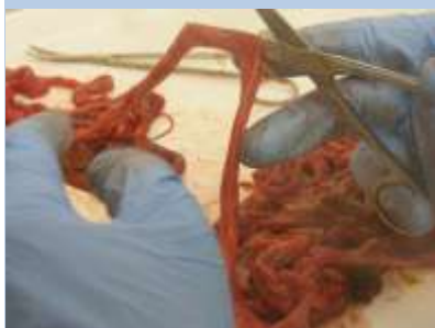
Examination of intestinal tract. This image shows an adult B. procyonis protruding from the tract where the incision is being made.

Prevalence of B. procyonis is approximately 4% in Florida, which is much lower than many other states where prevalence rates ranged from 27-58%.