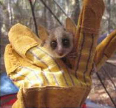
A gray mouse lemur ( Microcebus murinus ).

Data suggest that indri living in disturbed forests that have undergone human influence may experience physiological changes and increased susceptibility to parasitism, which may ultimately impair reproductive success and survival.