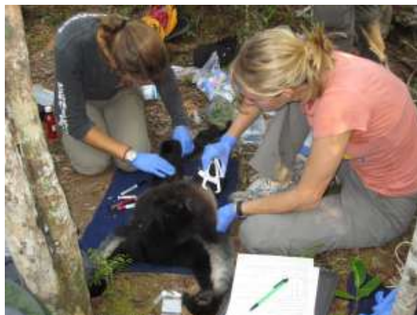
Conducting a health evaluation in the field on an Indri indri .

Lemurs are particularly emblematic of Madagascar's biodiversity, as they comprise more than 15% of the world's extant primate species (Mittermeier et al. 2008; Wilme et al. 2006). Lemur survival is currently threatened by intense anthropogenic pressure from growing human populations, shifting land use patterns, increasing deforestation and a changing climate (Allnutt et al. 2008; Dufils 2003; Elmqvist et al. 2007; Harper et al. 2007; Myers et al. 2000). Lemurs are currently considered to be some of the most endangered primates in the world. In fact, 91% of the world's lemur species are now listed as critically endangered, endangered or vulnerable on the Internation-