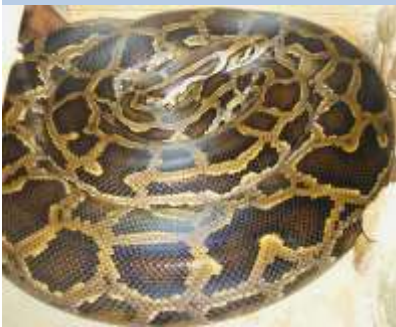
Burmese python.

Understanding how invasive species alter ecosystem function and the services that healthy ecosystems provide is a critical first step in managing the problem of invasions.