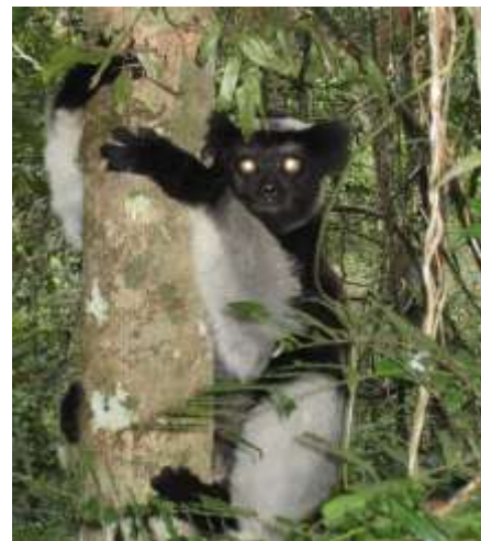
An indri, the largest of the lemurs.

Disease transmission risk is especially relevant when considering primate hosts, such as lemurs, because of the close phylogenetic relationship to humans. Researchers have documented cases of West Nile Virus and toxoplasmosis within lemur populations, which could potentially be transferred among human, domestic and wildlife hosts. Thus far, no documented case of disease transmission from lemurs to humans has been recorded.