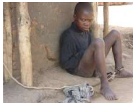
Child victim of nodding disease tethered to house to prevent wandering off.

Africa is continuing to produce outbreaks of other weird and dangerous diseases. A rare and unexplained brain disease has affected hundreds of Ugandan children, health workers say. The "nodding disease" causes seizures, and affected children become physically and mentally stunted, which can lead to blindness and even death. The seizures normally occur when the sufferers start to eat, or when it is particularly cold. Other symptoms include: severe stunting, poor sexual development, and mental retardation. The age of onset was mostly found to be 9-16 years. No post mortem results have been reported. Cases of the disease are now being found among adults, with Kitgum Woman MP Beatrice Anwyar placing the figure at about 49. The best-known concentration of "nodding disease" cases had previously been in the southern Sudan, where cases have been reported dating back to the 1980s. A link with onchocerciasis (river blindness) has been suggested. It was observed that no further cases were recorded in Uganda after elimination of the onchocer-