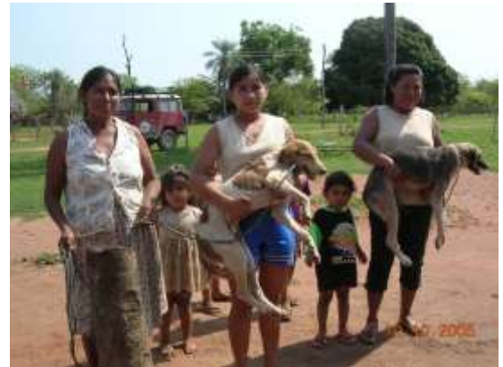
People in a village in Bolivia bring their dogs to a mobile clinic as part of a zoo-led health assessment to understand disease risks at the interface of wild carnivores and domestic dogs in the region.

In 2001, it was estimated that between all the zoos accredited by the World Association of Zoos and Aquariums (WAZA) there were approximately 1,100 field-based projects in 80 countries. Zoo-funded and zoo-led in situ conservation projects occur in both biodiversity and pandemic pathogen hotspots. The often long-term commitment to field conservation and research from these programs allows zoo staff to perform health surveillance studies on wildlife and domestic animals.