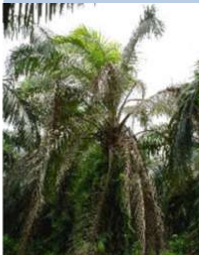
Lethal wilt, oil palm