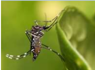
Aedes aegypti mosquito