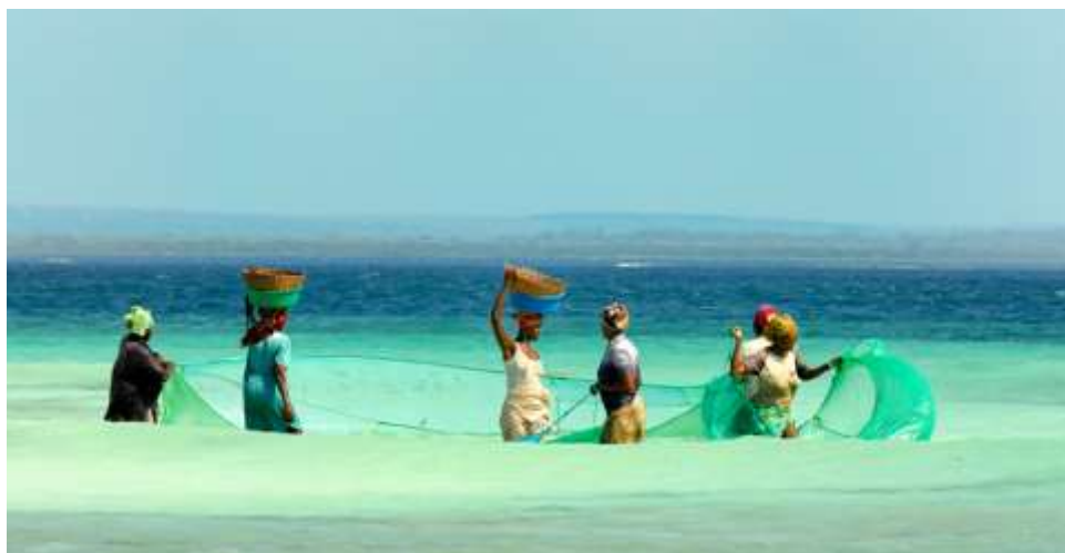
HEAL—Health & Ecosystems: Analysis of Linkages

The HEAL consortium believes that there are important public health impacts associated with changes in the state of different ecosystems and that, frequently, degradation of these ecosystems leads to negative public health impacts. However, relatively little peer-reviewed literature delves into the mechanisms underlying potential causal relationships between ecosystem degradation and public health outcomes. Policy-makers interested in understanding these relationships are left with largely anecdotal information that is clearly insufficient for informing decision-making in terms of conservation, public health, or both.