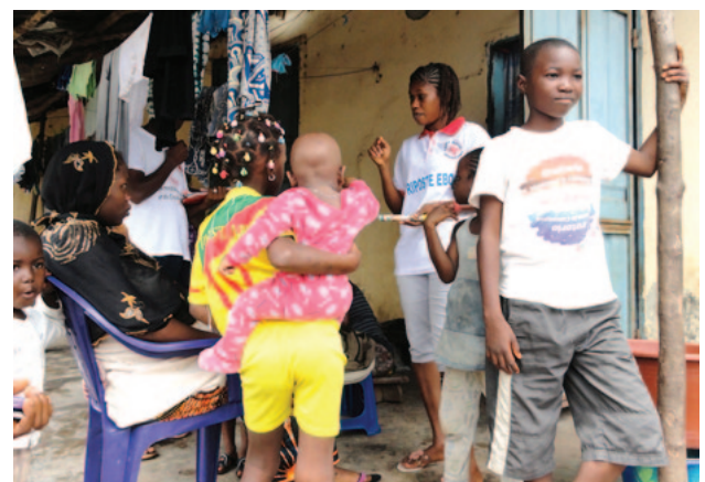
Guinea Red Cross volunteers travel door-to-door sharing information about Ebola.

The good news about this terrible epidemic is that Liberia was declared Ebola-free as of 9 May 2015, 42 days (2 incubation periods) after the last known case, with a final total of 10 666 cases & 4806 deaths, of which 3151 cases were confirmed; the number of confirmed deaths is not yet available. The bad news is that since the week ending 10 May 2015, when a