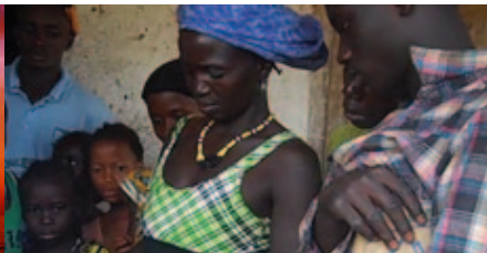
StopRats in Africa, p. 2