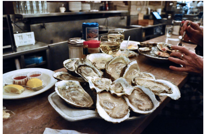
Oysters ready to be consumed.

Verde (islands off the west coast of Africa) in March for the first time since 2009. There were also first reports of lumpy skin disease in cattle in Saudi Arabia, and an oyster disease, Bonamiosis , in Denmark. A different oyster disease, perkinsosis , caused an outbreak in Australia.