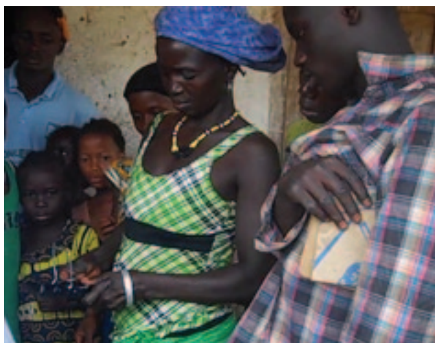
Photo 1. Rural community members learn how to use new technology traps as part of StopRats demonstration activities about intensive trapping for managing rodents in households.