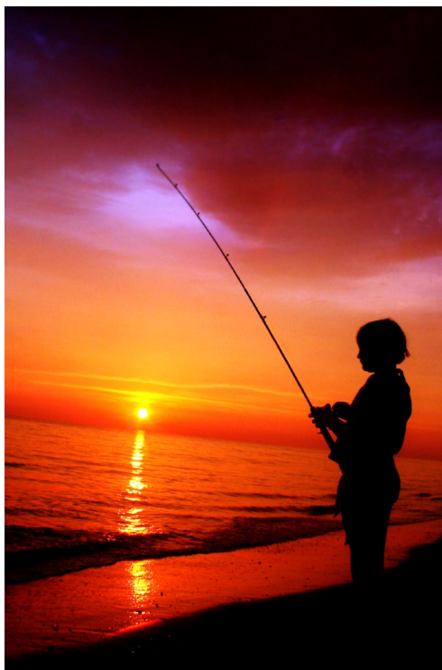
Uncertainty over seafood safety caused anxiety in coastal communities in the wake of the spill.

We learned that different communities are different. People catch, harvest and consume seafood differently