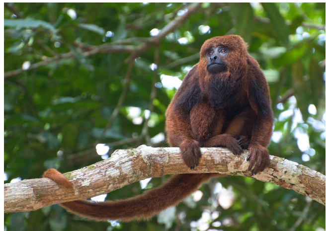
Brown howler monkey near Caratinga, Minas Gerais, Brazil.

Yellow fever (YF) seems to break out in the central Brazilian forest (not just in the Amazon) in approximately seven-year cycles, long enough for howler monkey populations to recover from their mortality in the previous epizootic. Brazil reported no cases of YF in 2014, but a few monkey carcasses were found in a forest in Tocantins state that year, indicating that YF