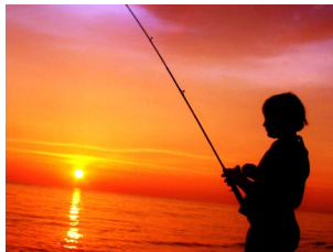
Deepwater Horizon oil spill impacts, p. 5

This quarterly newsletter is dedicated to enhancing the integration of animal, human, and environmental health for the benefit of all by demonstrating One Health in practice.