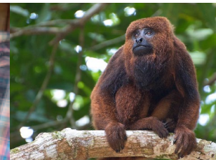
ProMed Update, p. 11