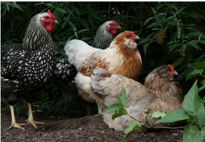
Chicken flock.

H5N2: An outbreak was identified in a series of chicken and turkey farming operations in the Midwestern region of the USA and Canada. As of 30 May, more than 43 million birds in 15 US states had been destroyed in an attempt to stop its spread, including nearly 30 million in Iowa alone, the nation's largest egg producer. Egg prices around the country more than doubled in May.