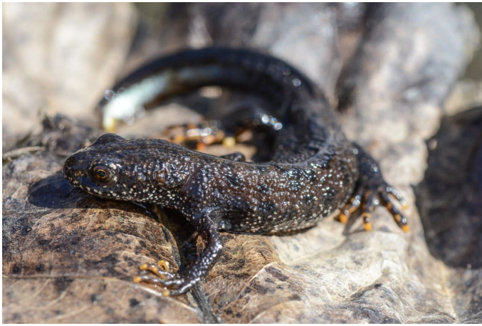
Great crested newts, native to the UK, could be in danger if chytrid fungus spreads to wild populations.

around 300 unique species of frogs. The pathogen is classified as one of the greatest threats to biodiversity worldwide.