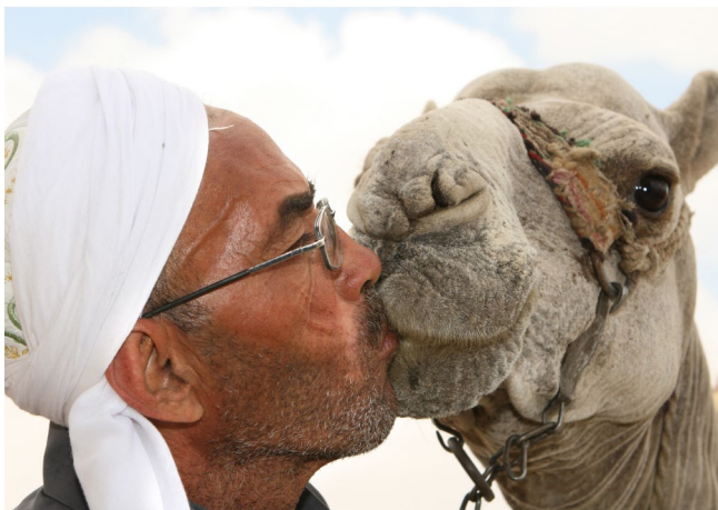
Man kissing camel.

Globally, WHO has been notified of 1149 laboratory-confirmed cases of infection with Middle Eastern Respiratory Syndrome coronavirus (MERS-CoV) since 2012, including at least 431 related deaths (crude CFR 38%). Most of those have been in Saudi Arabia,