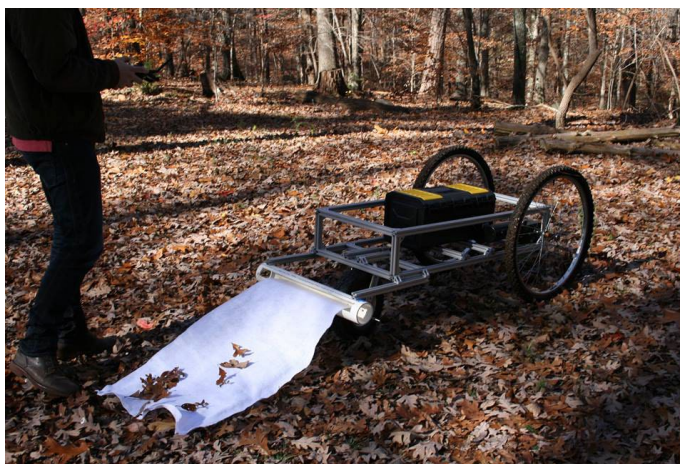
The new tick collecting robot, Tick Magnet, at Duke University.

https://globalhealth.duke.edu/media/news/tick-collection-theres-bot