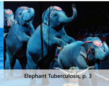
Elephant Tuberculosis, p. 3