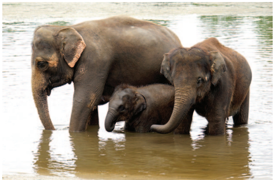
Asian elephants.

African and Asian elephants are both susceptible to infection by Mtb complex organisms. Since 1996, elephant tuberculosis has emerged in the United States as a disease primarily of Asian elephants ( Elephas