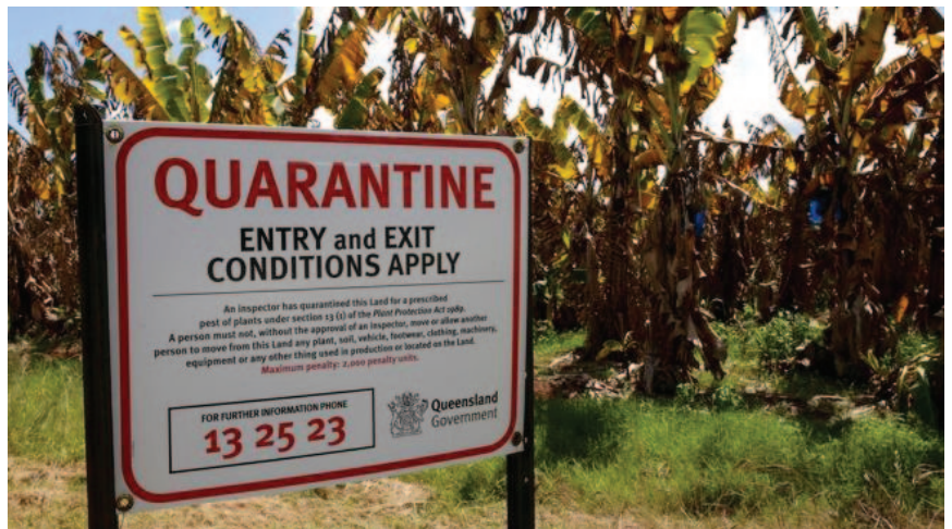
Banana crops quarantined due to Panama disease in Australia, Photo from news.com.au