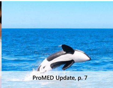
ProMED Update, p. 7