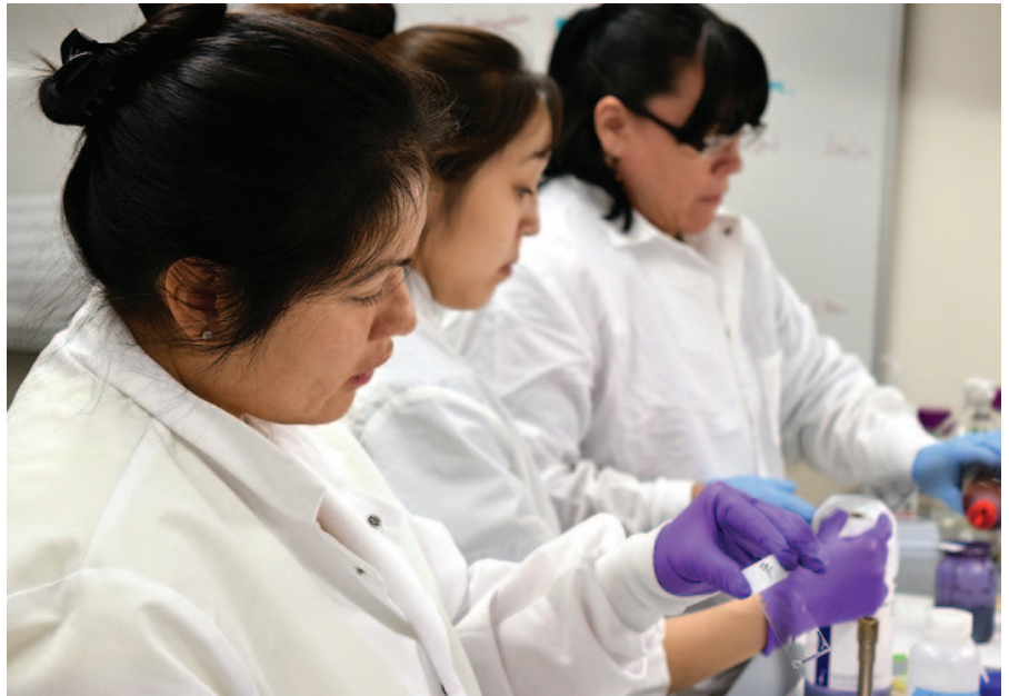
BLaST students analyzing samples in the laboratory.

Engagement of BLaST students is further enhanced by providing tiered-group mentoring to complement the experiential learning activities of the program, especially the active participation in genuine research projects connected to the One Health theme. In tiered-group mentoring, multiple researchers at a variety of career stages mentor each undergraduate student. The range of mentors includes senior faculty, junior faculty, postdoctoral fellows, staff research technicians, graduate students and fellow undergraduate students. Tiered-group mentoring provides students with advice and role models from all aspects of the research enterprise and facilitates students'