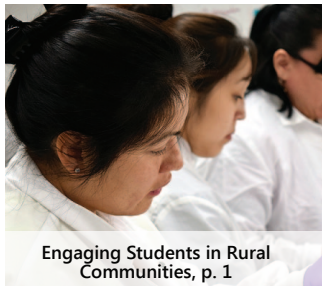
Engaging Students in Rural Communities, p. 1

This quarterly newsletter is dedicated to enhancing the integration of animal, human, and environmental health for the benefit of all by demonstrating One Health in practice.