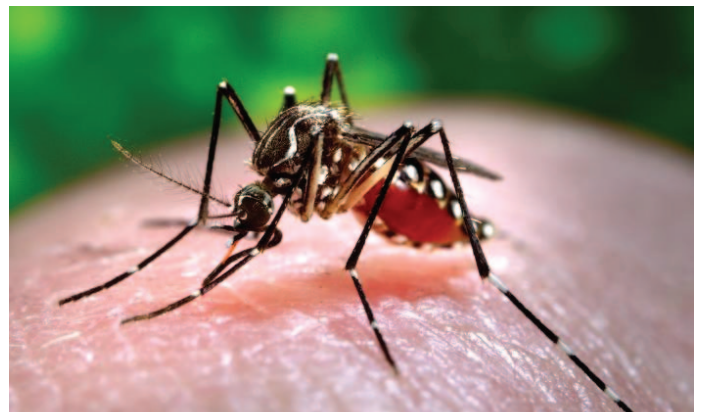
The Aedes aegypti mosquito is the primary vector of both yellow fever virus and Zika virus.

By the end of March Angola had reported over 1,400 cases (490 confirmed) with 198 deaths, probably gross underestimates, and had vaccinated 88% out of a target population of 6.6 million in Luanda, but YF has now spread to much of the rest of the country of 24 million. Cases have been reported from the Democratic Republic of the Congo, Mauritania, and Kenya in arriving Angolans, but no reports yet of spread within these countries.