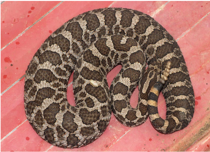
Up to 90% of infected massasauga rattlesnake may die from snake fungal disease.

Elephants are in the news for multiple reasons of concern. All Asian elephants in United States zoos have tuberculosis because one of the original animals imported and its Asian keeper were infected - nobody knows which had the disease first. Elephants are frequently exchanged between zoos and circuses, although they are no longer exhibited in circuses in the USA. Sadly, many African elephants have been poisoned with cyanide in their salt licks by poachers in a Zimbabwe game park for their tusks. Heavily armed men have killed rangers who try to stop them. Poachers get USD 20 per kilo for the ivory, which sells in the Far East for USD 3000 per kilo. Anthrax has killed nine elephants in a sanctuary in India.