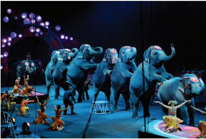
Elephants performing at a circus show.