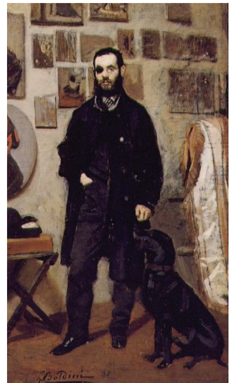
Portrait of Giuseppe Abbati by artist Giovanni Boldini {{PD-US}}.