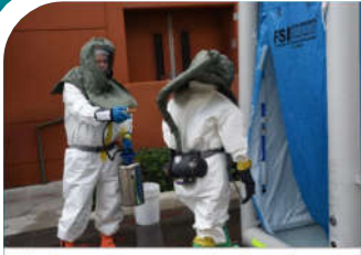
The Decon team preparing for action at Nicklaus Children's Hospital in Miami as part of the 2019 FL Chemical Threat Exposure Exercise (CTEE)

The Jacksonville CT laboratory is equipped with state-of-the-art instruments used for chemical analysis which include gas chromatography-mass spectrometry (GC-MS), liquid chromatography tandem mass spectrometry (LC-MS/MS) and inductively coupled plasma mass spectrometry (ICP-MS). The laboratory maintains operational capacity by performing monthly proficiency testing and by participation in CDC sponsored exercises. Each year the CDC sends mock samples to be tested to assess the surge capacity of its Level 1 labs.