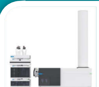
The LC/Q-ToF instrument used for opioid analysis in the CT Lab

Contributing to a healthier Florida one test at a time