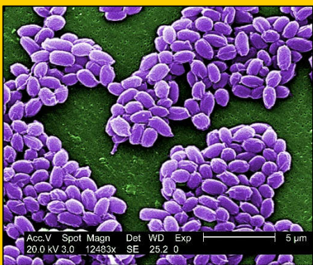
CDC 2002 Laura Rose Under a high magnification of 12,483X, this scanning electron micrograph (SEM) depicted spores from the Sterne strain of Bacillus anthracis .

1325 NW 14 th Avenue Miami, FL 33125-1614 Office: 305-325-2548 Jillien.Durand@FLhealth.gov