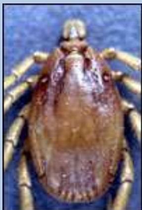
Hyaloma tick

Yap had a big Zika epidemic in 2007, which spread to Guam. Although both