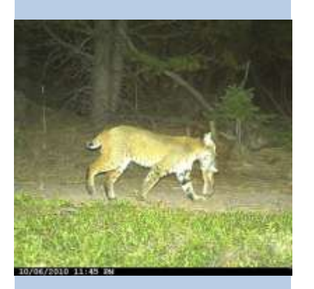
Bobcat with cottontail rabbit on a motion-activated camera at the Colorado Front Range.