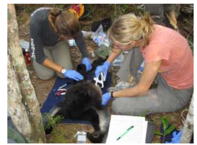
Conducting a health evaluation in the field on an Indri indri .

Lemurs are particularly emblematic of Madagascar's biodiversity, as they comprise more than 15% of the world's extant primate species (Mittermeier et al. 2008; Wilme et al. 2006). Lemur survival is currently threatened by intense anthropogenic pressure from growing human populations, shifting land use patterns, increasing deforestation and a chang-