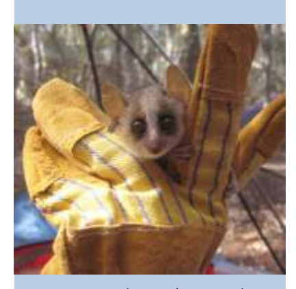
A gray mouse lemur ( Microcebus murinus ).

Data suggest that indri living in disturbed forests that have undergone human influence may experience physiological changes and increased susceptibility to parasitism, which may ultimately impair reproductive success and survival.