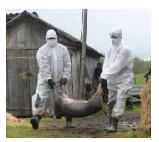
Mass culls and vigilant hygiene are the main forms of defense against African swine fever.

A fourth case of bovine spongiform encephalitis (BSE) was confirmed in the USA since the first case, found in 2005. A California cow that tested positive for the disease was never destined for the meat market, and some scientists be-