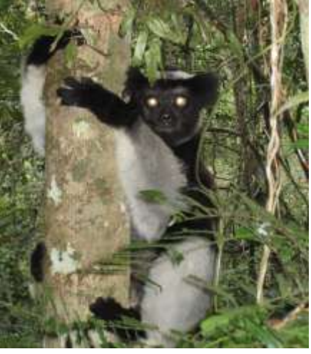
An indri, the largest of the lemurs.

Consistent baseline health monitoring provides an effective tool for evaluating lemur health and also serves as an early warning sign