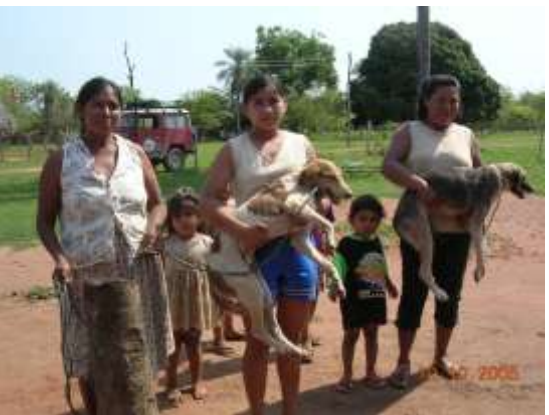
People in a village in Bolivia bring their dogs to a mobile clinic as part of a zoo-led health assessment to understand disease risks at the interface of wild carnivores and domestic dogs in the region.

In 2001, it was estimated that between all the zoos accredited by the World Association of Zoos and Aquariums (WAZA) there were approximately 1,100 fieldbased projects in 80 countries. Zoo-funded and zoo-led in situ conservation projects occur in both biodiversity and pandemic pathogen hotpots. The often long-term commitment to field conservation and research from these programs allows zoo staff to perform health surveillance studies on wildlife and domestic animals.