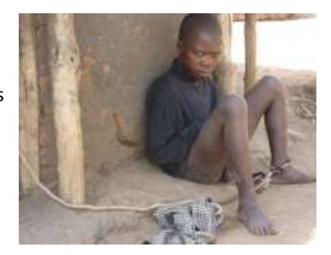
Child victim of nodding disease tethered to house to prevent wandering off.

Africa is continuing to produce outbreaks of other weird and dangerous diseases. A rare and unexplained brain disease has affected hundreds of Ugandan children, health workers say. The "nodding disease" causes seizures, and affected children become physically and mentally stunted, which can lead to blindness and even death. The seizures normally occur when the sufferers start to eat, or when it is particularly cold. Other symptoms in-