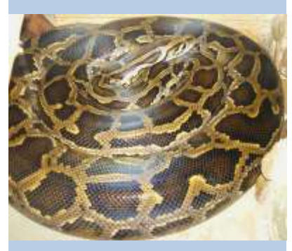
Burmese python.

Understanding how invasive species alter ecosystem function and the services that healthy ecosystems provide is a critical first step in managing the problem of invasions.