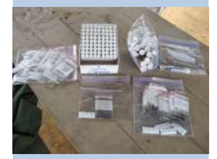
Collected hair, skin, and fecal samples ready for processing.

in the occurrence of an epizootic outbreak. These data provide information the managers and policymakers need to approach human and animal health with a multidisciplinary perspective. The Prosimian Biomedical Survey Project (PBSP) has been operating in Madagascar since 2000, and has assessed over 631 lemur individuals of 32 different lemur species at 20 sites. This project is structured to provide collaboration among field biologists, ecologists and veterinarians involved in conservation projects throughout Madagascar. Veterinarians provide basic medical assistance as needed, and collect standard biomedical samples and health information from animals anesthetized or captured for other purposes. A detailed description of sample collection methodology can be found in the these cited references (Dutton et al. 2003, 2008; Irwin et al. 2010; Junge et al. 2011; Junge et al. 2008; Junge and Garell 1995; Junge and Louis 2002; Junge and Louis 2005a, b, 2007; Junge and Sauther 2007).