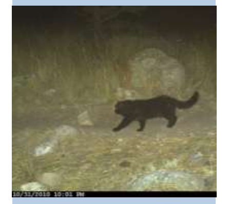
Domestic cat on a motionactivated camera.

Domestic cats and wild cats that share the same outdoor areas in urban environments can share diseases such as Bartonellosis and Toxoplasmosis that can also be spread to people.