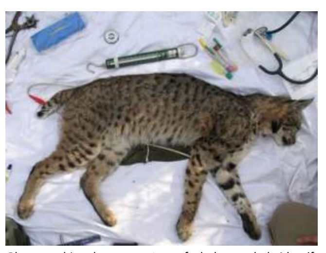
Photographing the spot pattern of a bobcat to help identify individual bobcats.

The project also looked at whether bobcats in southern California were segregated into different populations by major highways. By analyzing genetic and pathogen data, the scientists found that bobcats west or east of Highway 5 near Los Angeles rarely interbred, but that the bobcats did cross into each other's territory often enough to share diseases such as FIV.