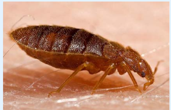
Bed bug images provided by U.S. Centers for Disease Control and Prevention