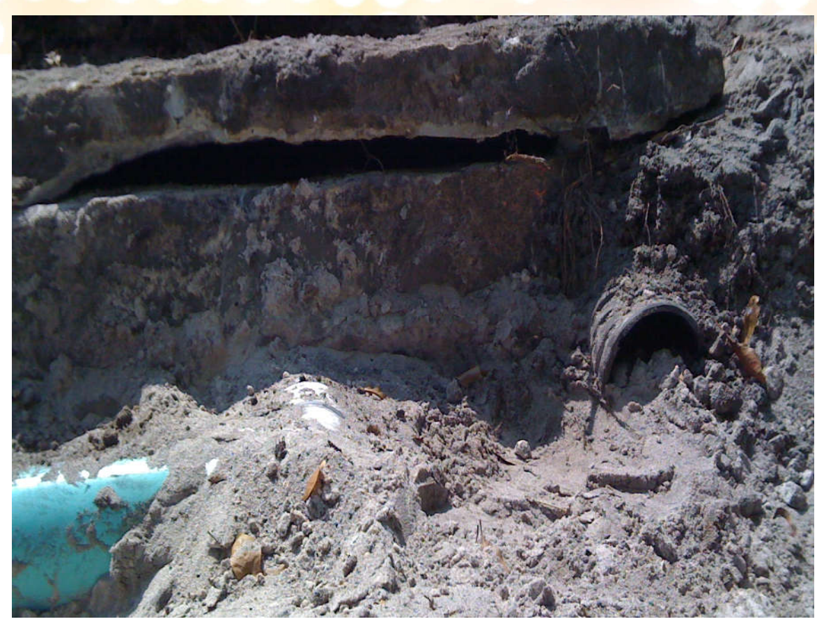
C - 10:15- 10:45 Septic Tank Contracting and Enforcement