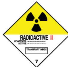
RADIOACTIVE YELLOW II