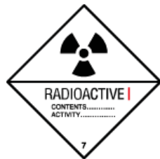
RADIOACTIVE WHITE I