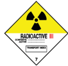
RADIOACTIVE YELLOW III

3. Overpacks. If a convenience overpack is used that prevents package labels from being visible, then all required labels must be applied to the overpack, along with a label bearing the following statement: “Inner Package Complies with Prescribed Specifications.”