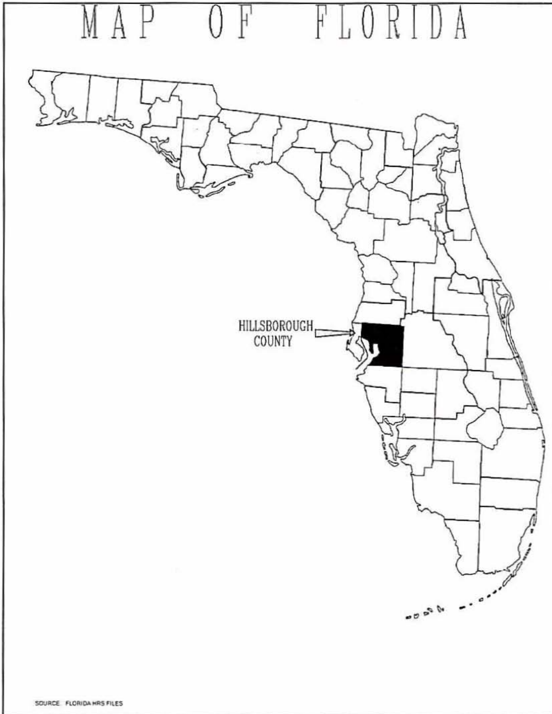
Figure 1. State Map Showing Location of Hillsborough County