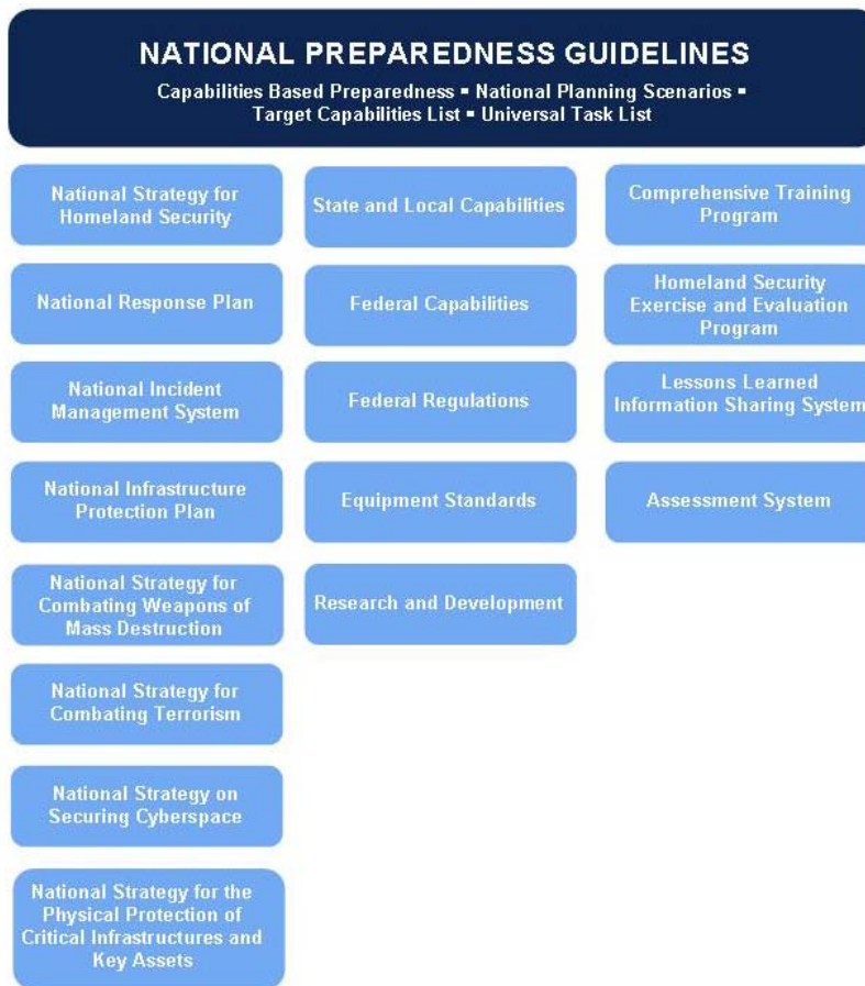
Figure 1: The Guidelines in Context

The Guidelines are umbrella documents that collate many plans, strategies, and systems into an overarching framework, the National Preparedness System. Plans and systems will be implemented and requirements will be matched with resources, consistent with applicable law and subject to the availability of appropriations.