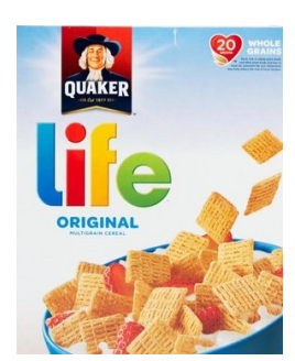
Quaker Life Original