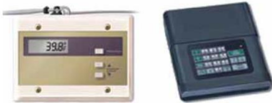
Continuous monitoring temperature alarm/notification systems

Alarms are useful tools to alert staff to potential problems. However, any alarm is only as good as the people responding to it. Large vaccine losses and the need to revaccinate have occurred despite using alarmed, continuous monitoring systems. Issues around untrained staff who do not know how to read the monitor, unexpected events, poor monitoring and response procedures, equipment failures, and improper maintenance have all been implicated in vaccine mishandling incidents.