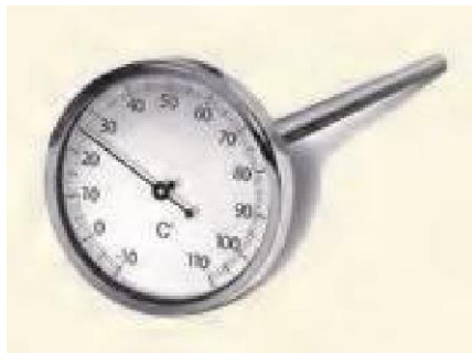
Bi-Metal Stem Thermometer