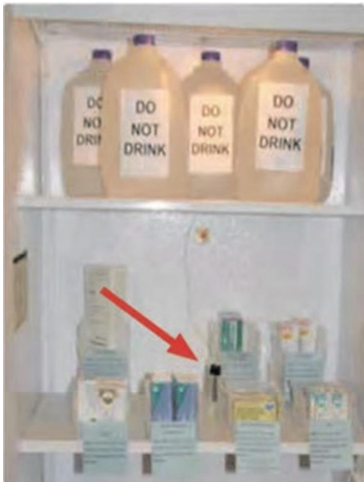
Placement of Probe