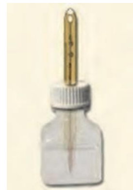
Fluid-Filled Bio-Safe Liquid