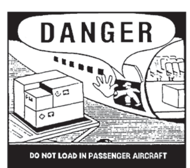
Cargo Only Label