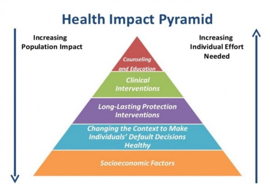
FIGURE 4: HEALTH IMPACT PYRAMID

Source: Frieden, T.R. (2010). A framework for public health action: The health impact pyramid. American Journal of Public Health , 100(4):590-595. Retrieved October 23, 2023 <a href="https://www.ncbi.nlm.nih.gov/pmc/articles/PMC2836340/">https://www.ncbi.nlm.nih.gov/pmc/articles/PMC2836340/</a>