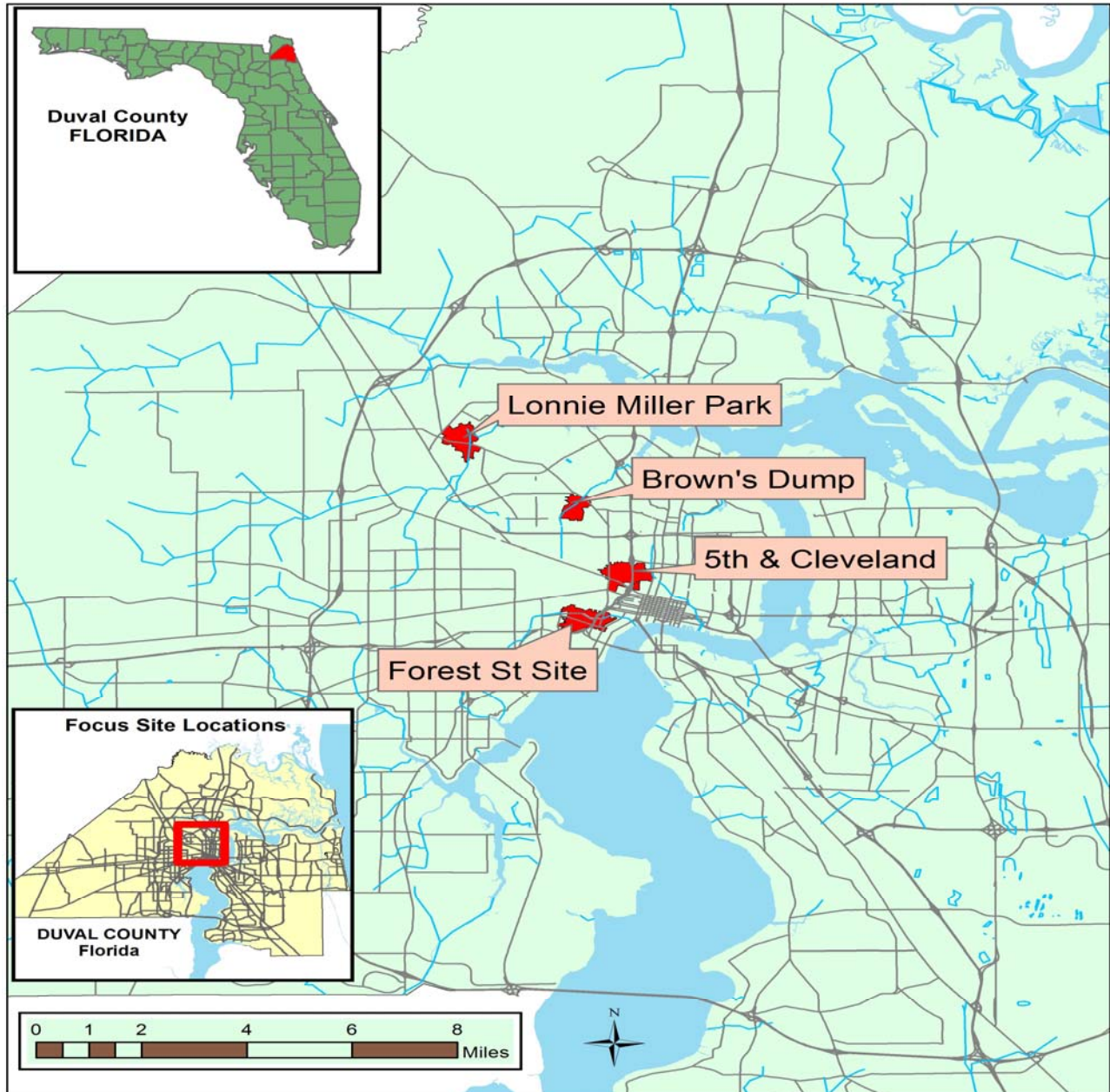
Figure 1. Map of ash sites contaminated in Health Zone 1

15,675 (12.8 %) children < than 9 years old, 8,427 (7 %) < than 5 years old (United States Census for Duval County, 2000). In addition 43% of the children live in poverty (United States Census for Duval County, 2000, Bureau of Labor Statistics, 2009). Lead levels in children of 10µg/dl or greater was measured in 3% of children (Duval County Health Department, Childhood Lead Prevention Program, 2000). Figure 1 is a map of Health Zone 1.