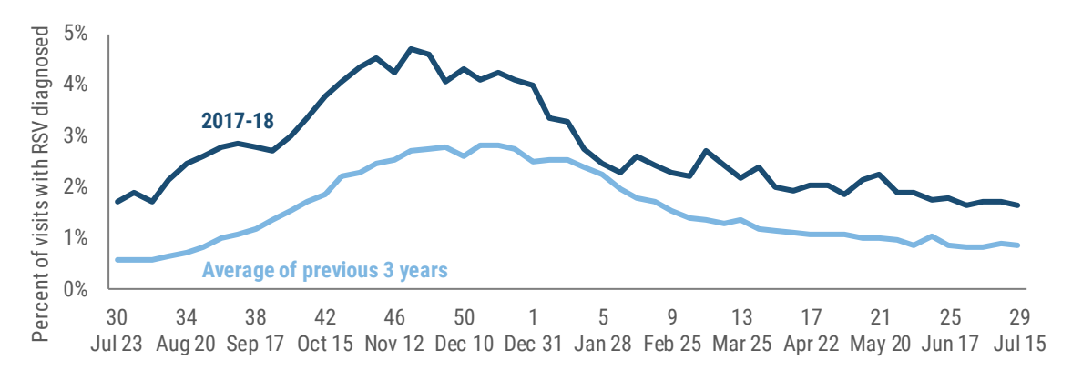
Week Date week started in 2017-18

During the 2017–18 RSV season in Florida, the percent of children <5 years old diagnosed with RSV at emergency department and urgent care centers in ESSENCE-FL increased from October to January and peaked in mid-November. The percent for 2017–18 season was greater than the average of the previous three seasons every week.