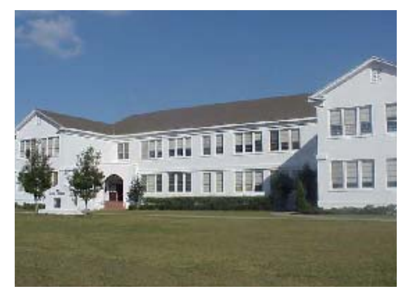
Altha School serves kindergarteners through twelfth graders in rural Calhoun County Florida. The county population is about 13,000 or roughly 23 persons per square mile (Figure 1). About 650 children attend the school, which was established in 1906.

In 1987, the Calhoun County School Board applied to DEP's Early Detection Incentive (EDI) program for Altha School. DEP approved