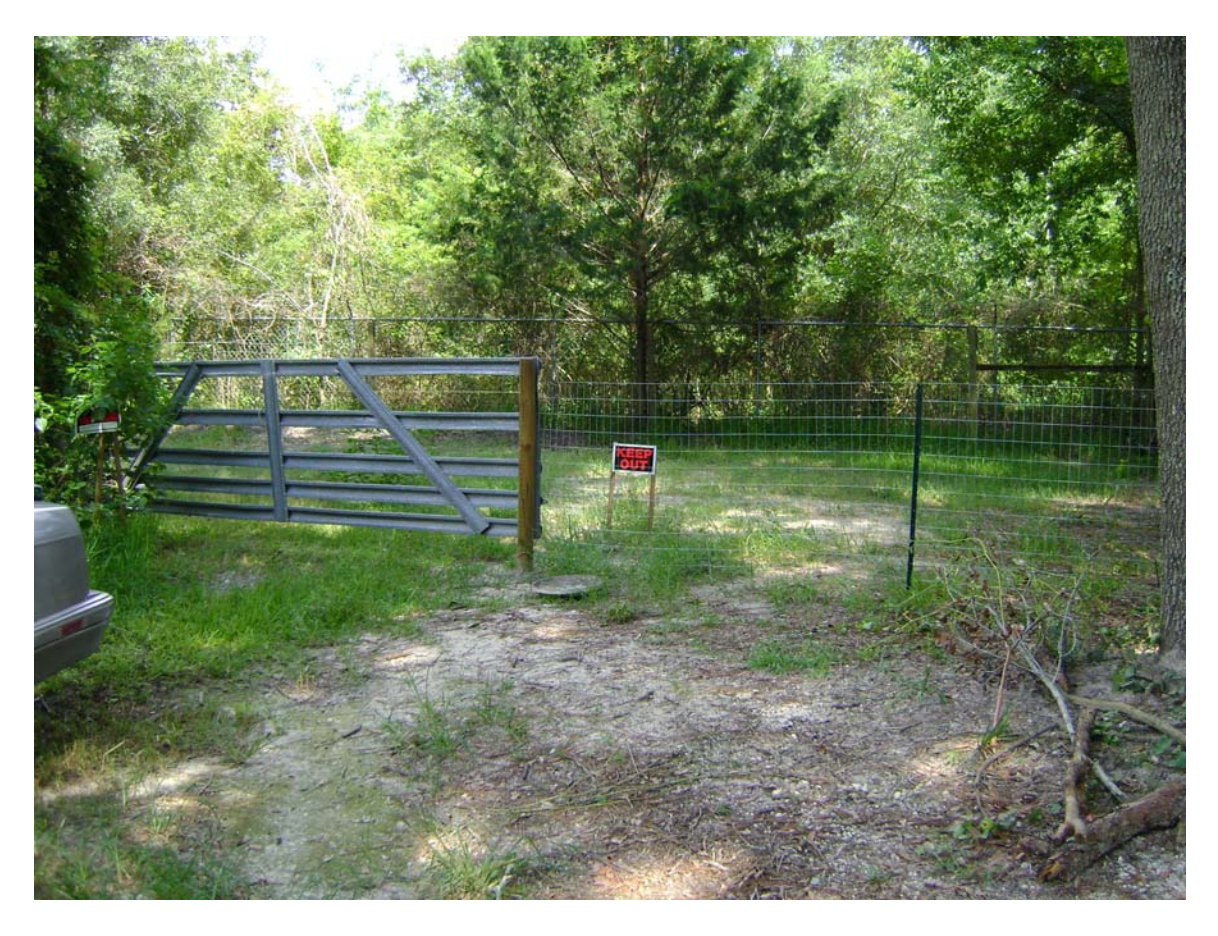
Figure 1. Restricted Access to the City Easement along the West Boundary of the Koppers Hazardous Waste Site