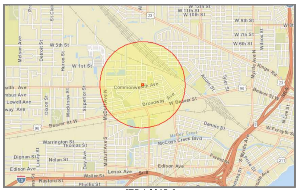
Figure 6. Area within one-half mile of the former Duval Plating site

In 2010, 2,379 people lived within one-half mile of the site (Figure 6). Of the total, 90% were black, 8% were white, 2% reported two or more races, and 2% reported as Hispanic, a Spanish cultural association that does not reflect race [EPA 2017a]. Fifty percent of those eligible completed high school and 62% of households earn less than 25,000 dollars a year. As young children are often the most sensitive to exposure, the Department looks for daycare facilities (including churches) and schools near the site. We located the Word of Life Community Church one-half mile west of the site, West Jacksonville Elementary 300 feet east of the site, and Smart Pope Livingston Elementary one-half mile east of the site [Google Maps 2017].