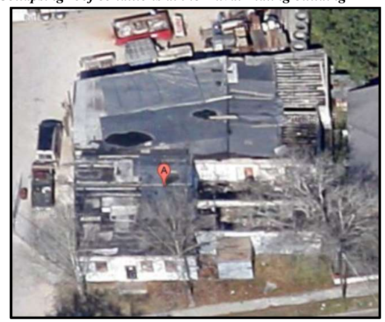
Figure 5. Collapsing roof conditions at the Duval Plating building

On October 29, 2014 EPA found incompatible wastes under a collapsing roof (Figure 5) [EPA 2015a]. They determined a release had the potential to impact the health of students attending the nearby school and nearby residents.