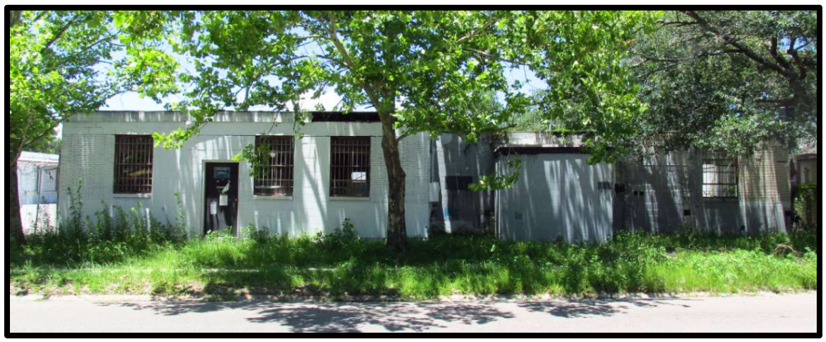
Figure 2. Former Duval Plating site, looking north from Commonwealth Avenue.

The 5,200 square-foot building on the site is concrete block and brick, with metal doors and barred windows (Figure 2). Much of the roof has fallen in and the City of Jacksonville has condemned the building. Grass and trees border the street and the side and rear yards are paved with asphalt.