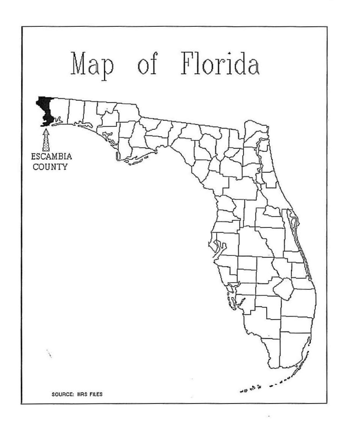
Figure 1. State Map Showing Location of Escambia County