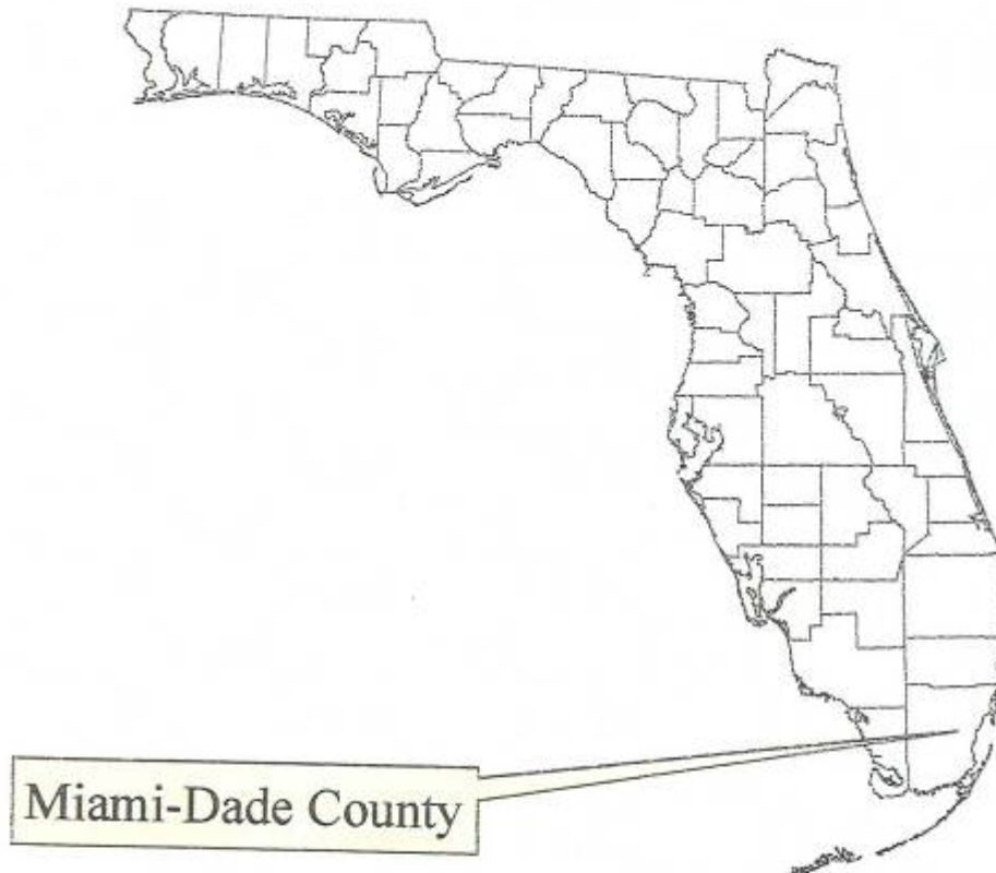
Figure 1 Miami Civic Center Property Florida Counties Map