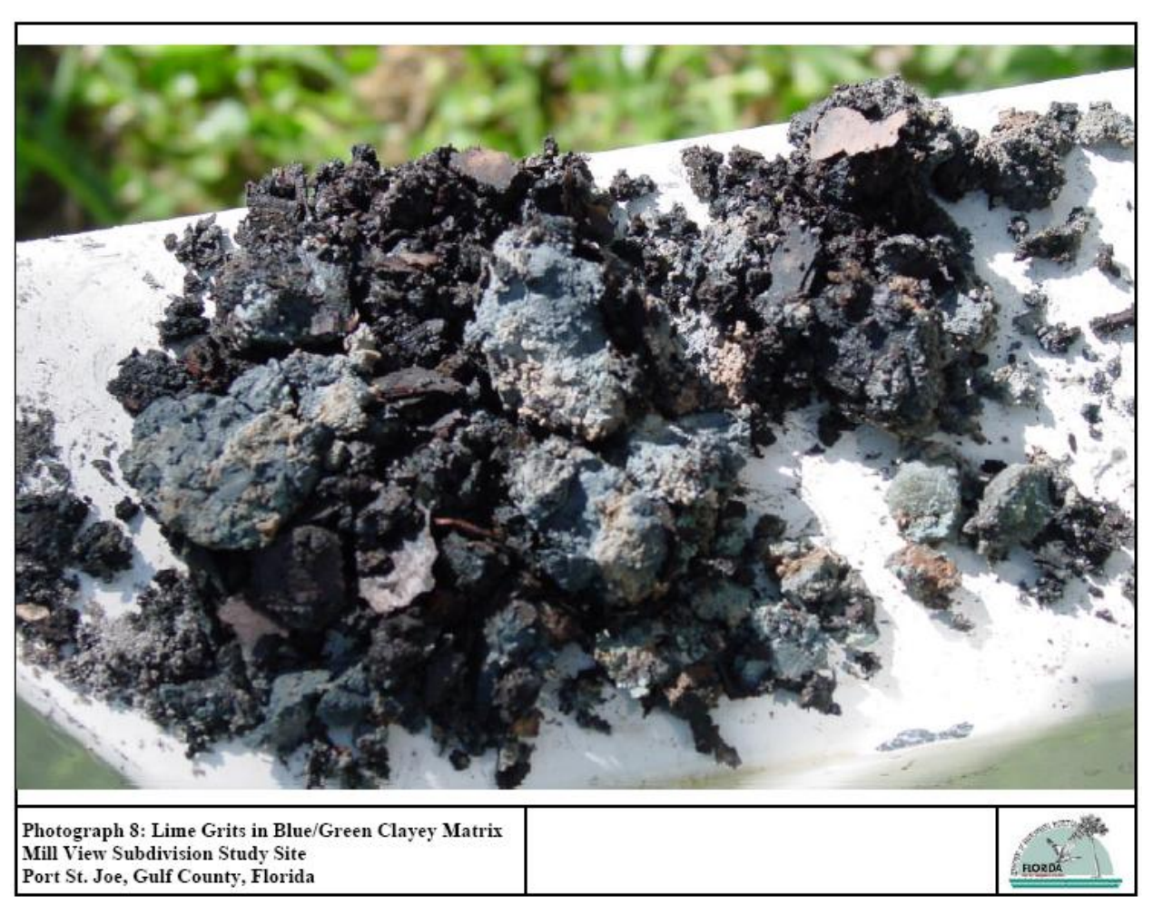
Figure 4. Lime Grits in Mill View Subsurface Soil (DEP 2003)