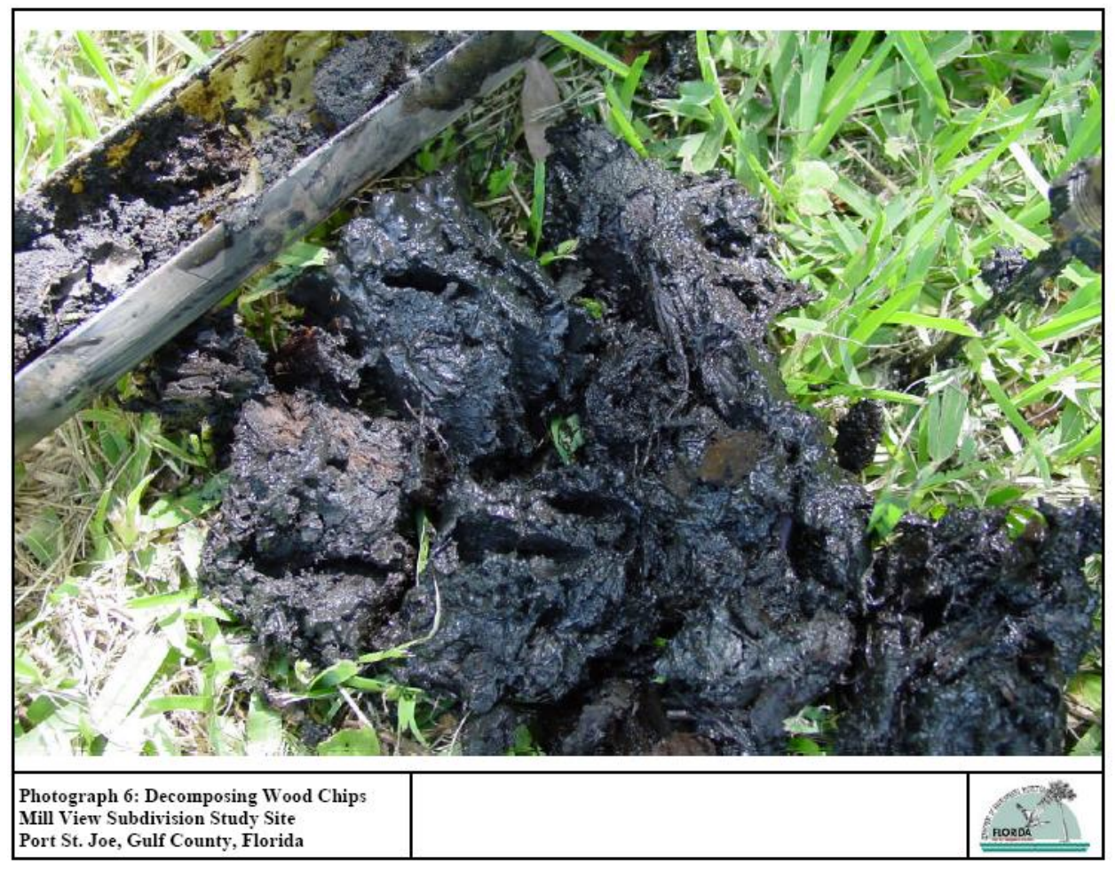
Figure 5. Decomposing Wood Chips in Mill View Subsurface Soil (DEP 2003)