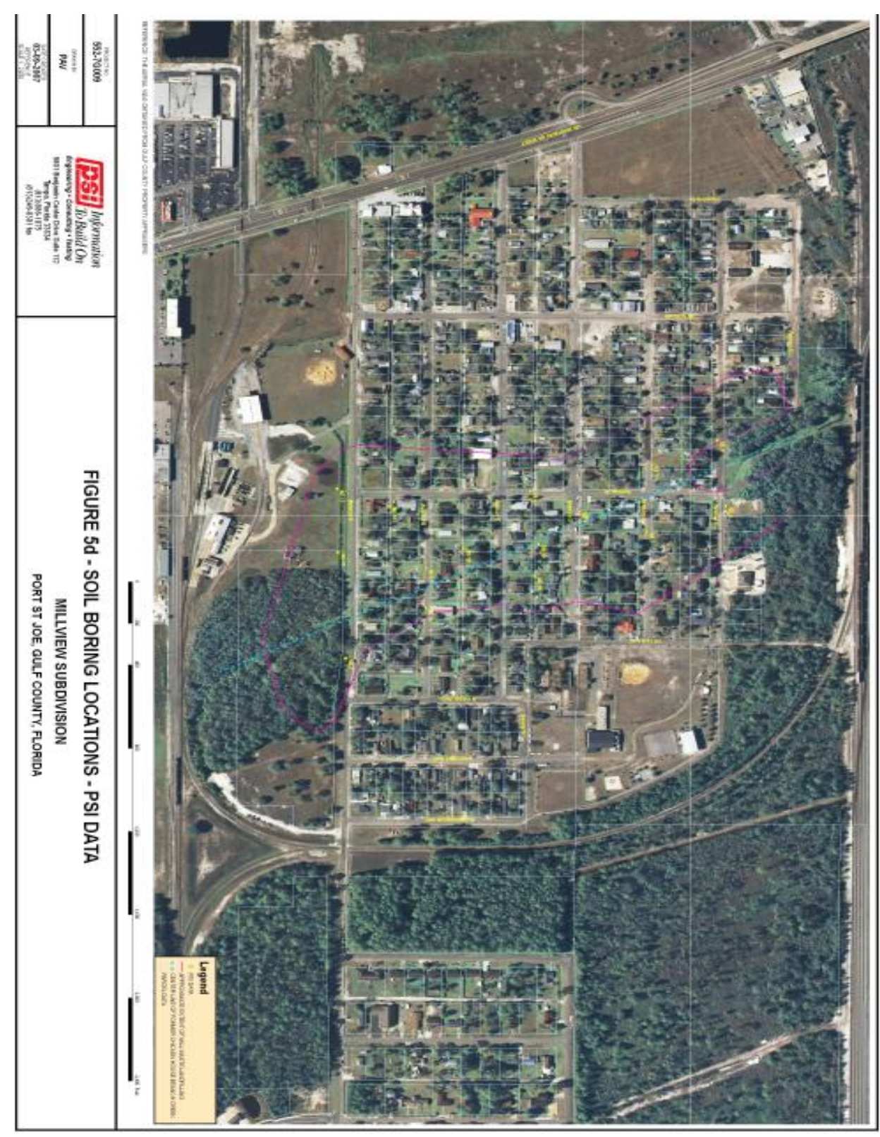
Figure 2. 2007 Mill View Subsurface Soil Sample Locations (PSI 2007)