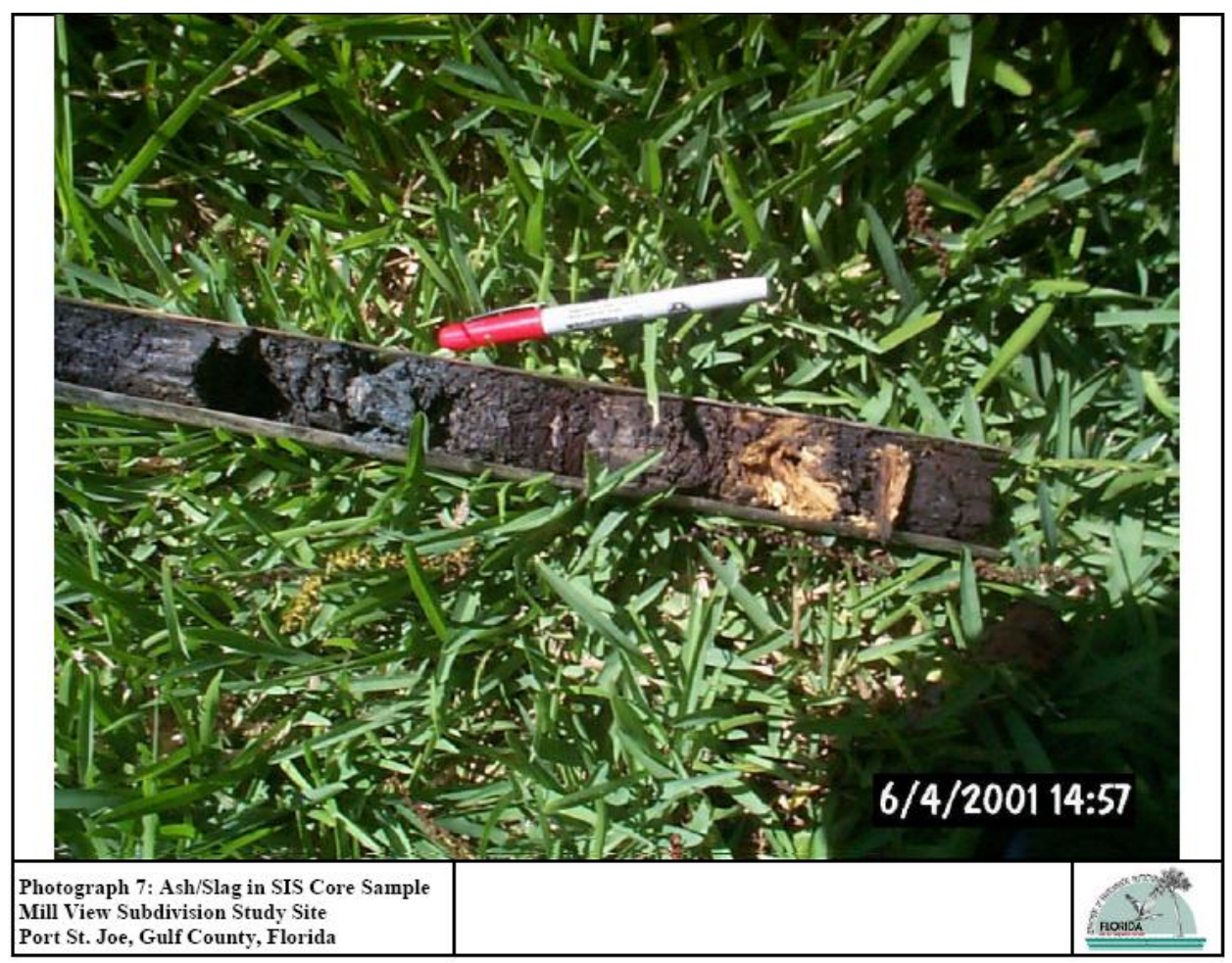
Figure 6. Ash/Slag in Mill View Subsurface Soil (DEP 2003)