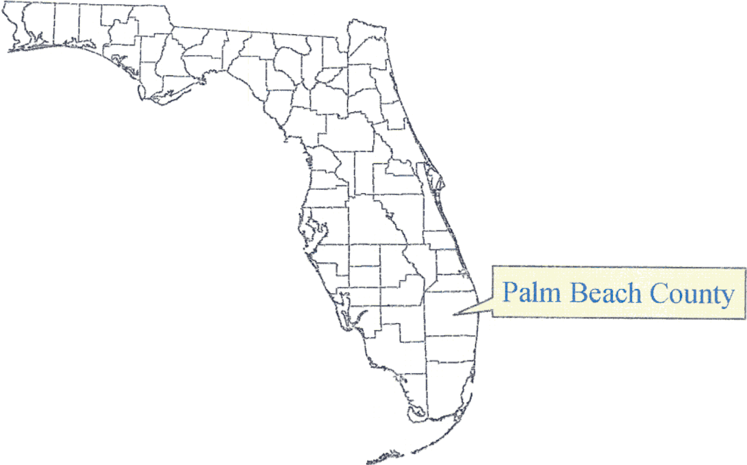
Figure 1 Mobile Medical Industries (MMI) County Location Map