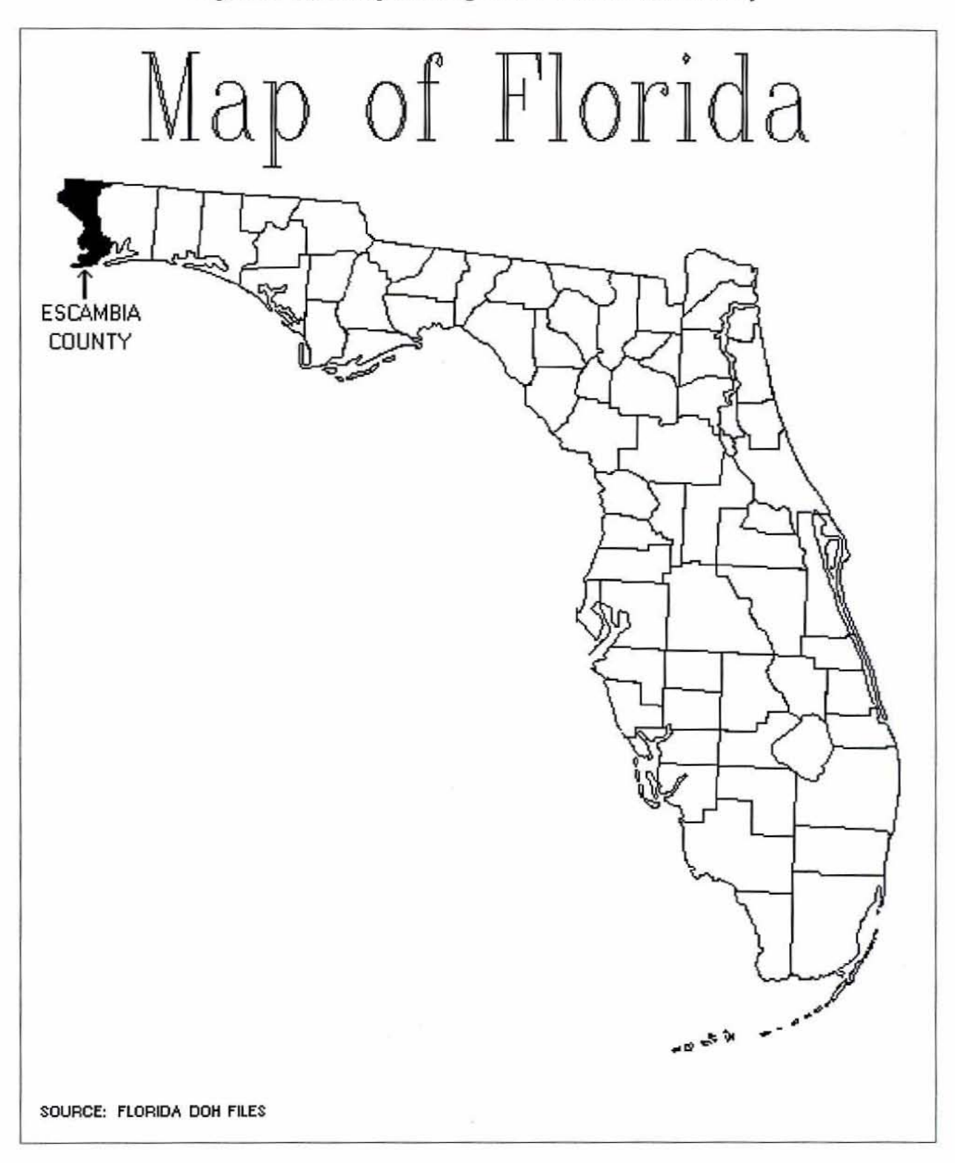
Figure 1. State Map Showing Location of Escambia County