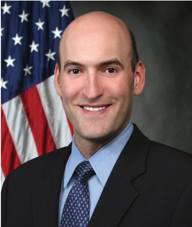
Chairman Gregory B. Jaczko

On May 13, 2009, President Barack Obama designated Dr. Gregory Jaczko as Chairman of the U.S. Nuclear Regulatory Commission (NRC). As Chairman, Dr. Jaczko is the principal executive officer and the official spokesperson for the NRC.