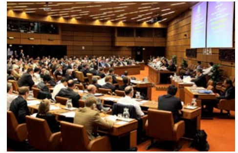
The Third Review Meeting Opening Session

During the week of May 11, 2009, FSME staff members participated in the Third Review Meeting of the Contracting Parties 1 on the Joint Convention for the Safety of Spent Fuel Management and on the Safety of Radioactive Waste Management (Joint Convention) at the International Atomic Energy Agency (IAEA) in Vienna, Austria. The FSME staff performed technical reviews, provided technical support and presented the interests of the United States.