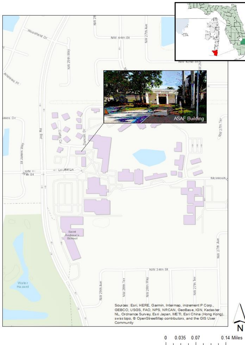
Figure 1. Saint Andrew's School, property and location.

The remedial system installation process started in July of 2017 and the system was turned on in October 2017. Within one hour of the system starting up, petroleum odors were reported inside the administration building and the system was subsequently turned off. A few days later, the system was restarted with SVE recovery only to reduce the odors in the building, but not eliminating the vapors. The system was run between December 2017 and January 2018; the sparge and SVE systems were deactivated in January of 2018 per request of the school administration due to reports of headaches and dizziness after work shifts. The SVE system was turned back on in an attempt to alleviate odors in the office building, but was ultimately shut down in February 2018.