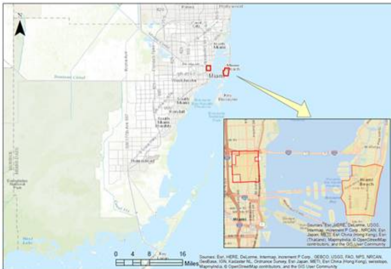
Areas of Active Local Zika Virus Transmission - August 22, 2016 Wynwood Area - NW 5th Avenue to the west, US 1 to the east, NWNE 38th Street to the north and NWNE 20th Street to the south Miami Beach Area - 28th Street to the north, 8th Street to the south, Intercoastal water to the west and the Atlantic Ocean to the east