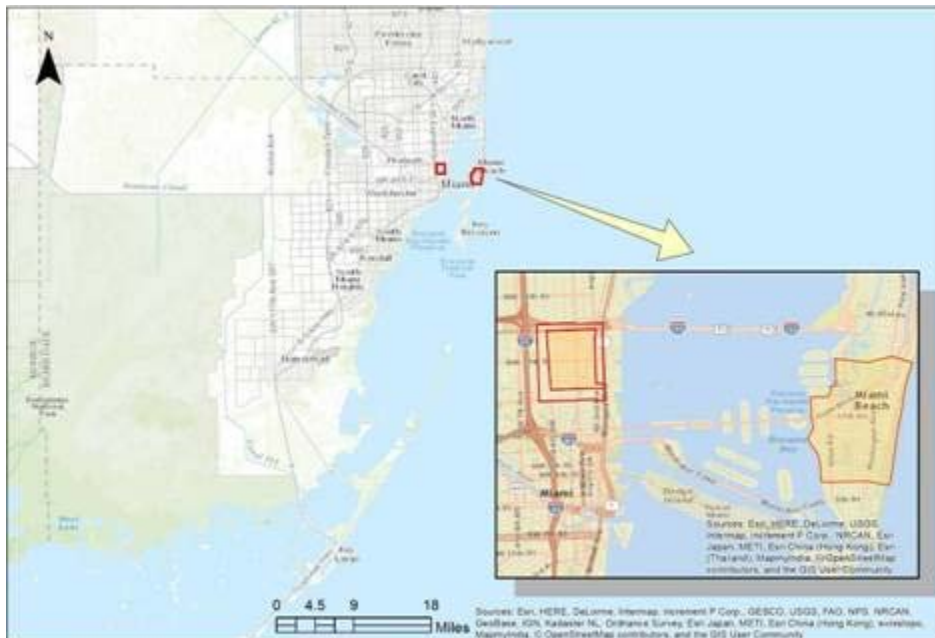
Areas of Active Local Zika Virus Transmission - August 23, 2016 Wynwood Area - NW 5th Avenue to the west, US 1 to the east, NW/NE 38th Street to the north and NW/NE 25th Street to the south Miami Beach Area - NW 22nd St at the south, NE 2nd Ave to NE 23rd St. at the east, NW 3rd Ave to the west, and NE 36th St to the north