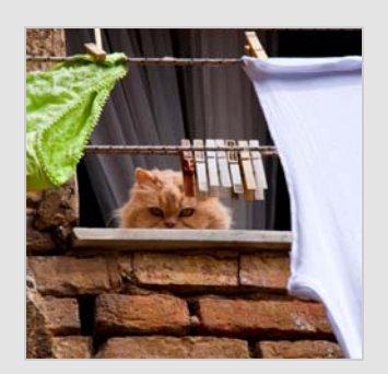
A candidate for "High-Rise Syndrome"