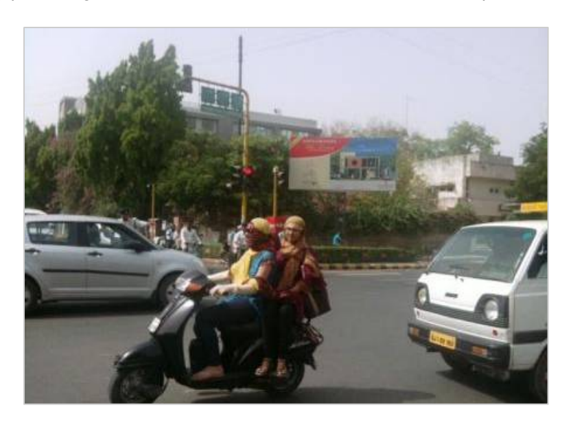
Women commuters in Ahmedabad cover their head and face to protect from direct sun. Courtesy Anjali Jaiswal, NRDC, during the March 2011 Heat Stress Workshop, Ahmedabad

Local officials, public health groups, non-profit community organizations, and the media should try to promote traditional practices to identify the processes by which these effectively protect against heat stress, so as so add validation where possible.