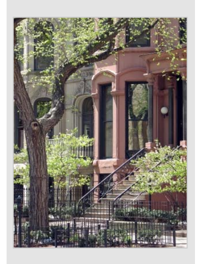
Everyone "knew" that trees cooled down buildings.

So how did all these trees benefit the city?