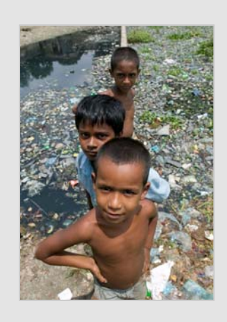
In Bangladesh, One Health is a particularly relevant approach to public health.