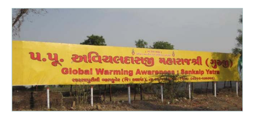
Roadside billboard in English and local language (Gujarati) emphasizing the importance of global warming. during the March 2011 Heat Stress

As Ahmedabad grapples with its second (and certainly not its last) heat wave this season, we will continue to devise strategies for preparedness, adaptation, and resilience for the city 's most vulnerable populations. Experts at the workshop -- organized by the Public Health Foundation of India, the Indian Institute of Public Health Gandhinagar, the Natural Resources Defense Council, and with the support of the Indo US Science and Technology Forum -- are actively engaged with the progressive leadership at the Ahmedabad Municipal Corporation to bring the best of science, technology, and tradition together into the preparedness plan.