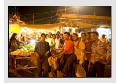
Many Gujaratis traditionally made their outdoor plans for later at night in the cool air.