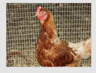
A major barrier to implementing a One Health approach is the institutional separation of government ministries responsible for human health, and the environment.

from agriculture than from any other sector. The Bangladeshi population has exceptionally close contact with domestic animals. For example, 61% of rural Bangladeshi households raise poultry and over half of these keep their poultry inside their homes (7).