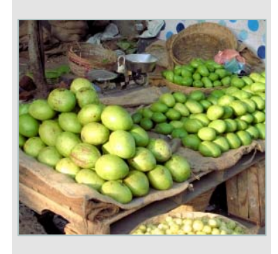
Diet also plays a role in protecting against heat stress.