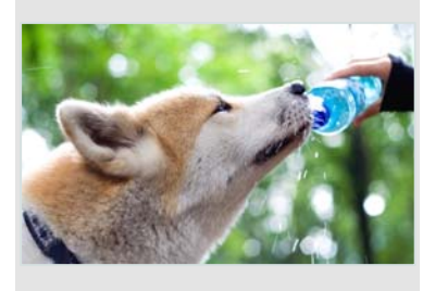
Never leave your pet alone in a parked car.