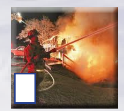
Can you match the titles below with the pictures above? Mark the box with the appropriate letter.

A. Wildfire B. Flood C. Rip Current D. Hurricane