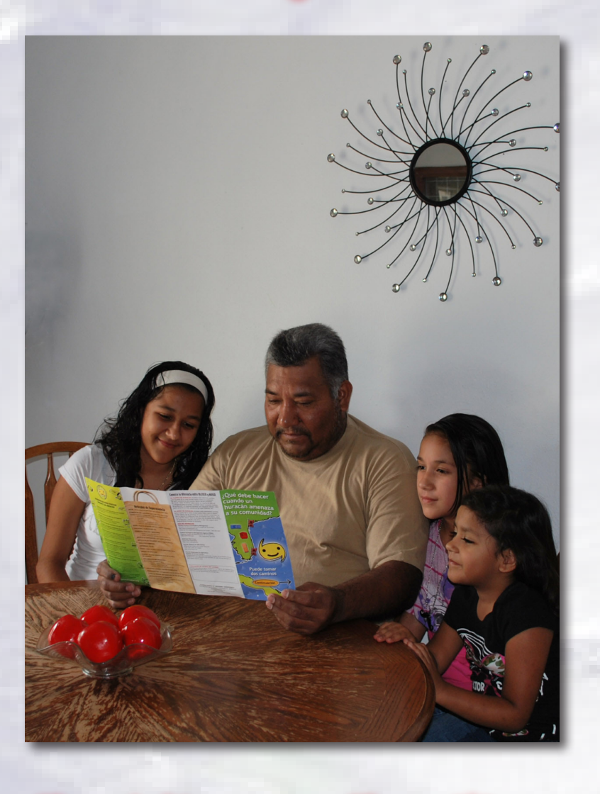
For Migrant Families