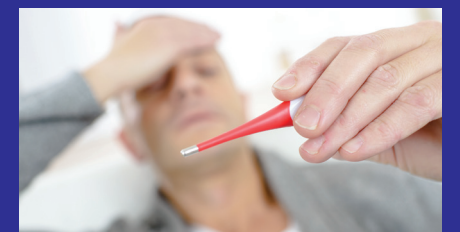
[Sore Throat with Fever]