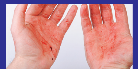
[Unprotected & Infected Wounds]