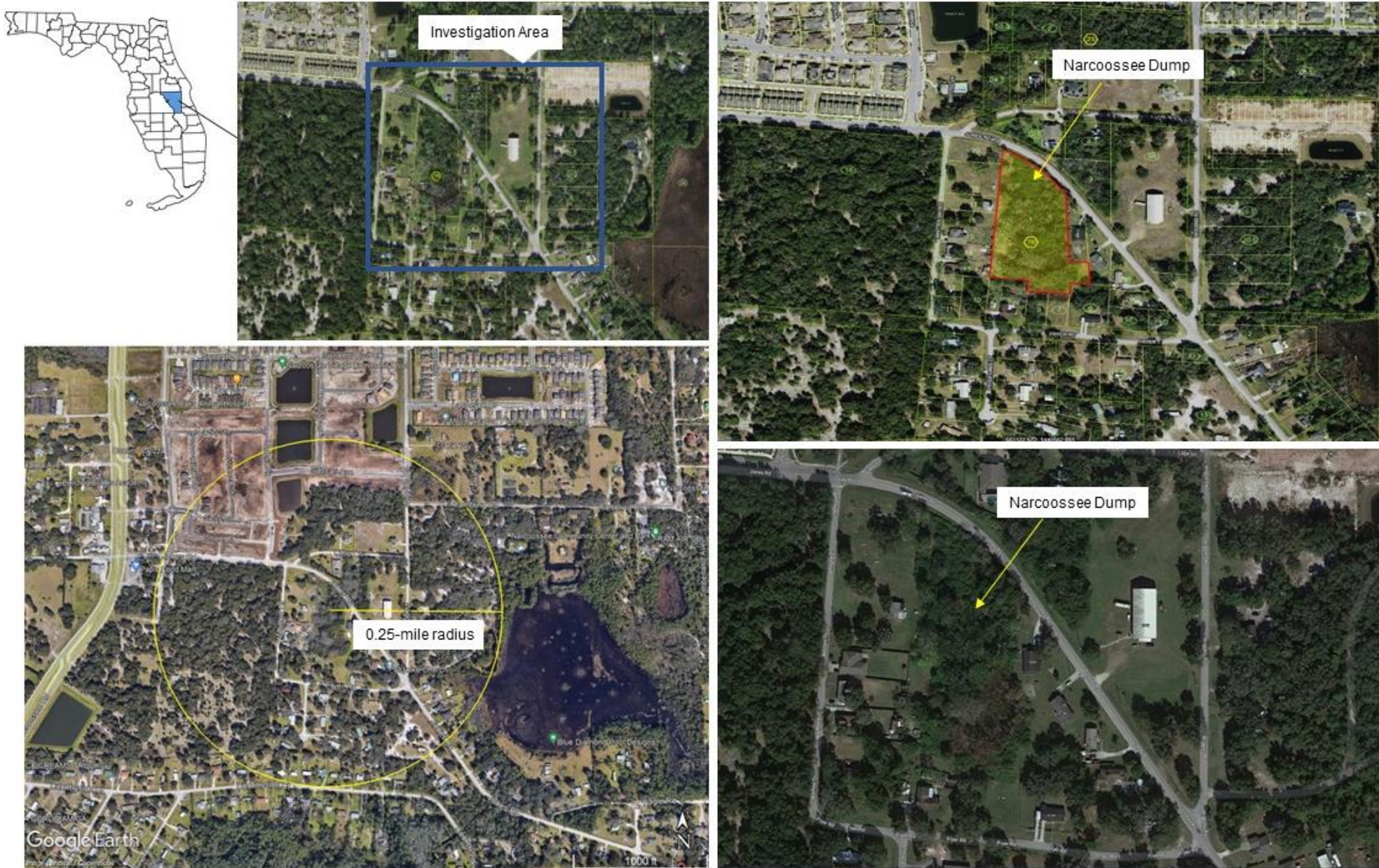
Figure 1: Narcoossee Dump, Saint Cloud, Osceola County—site location.