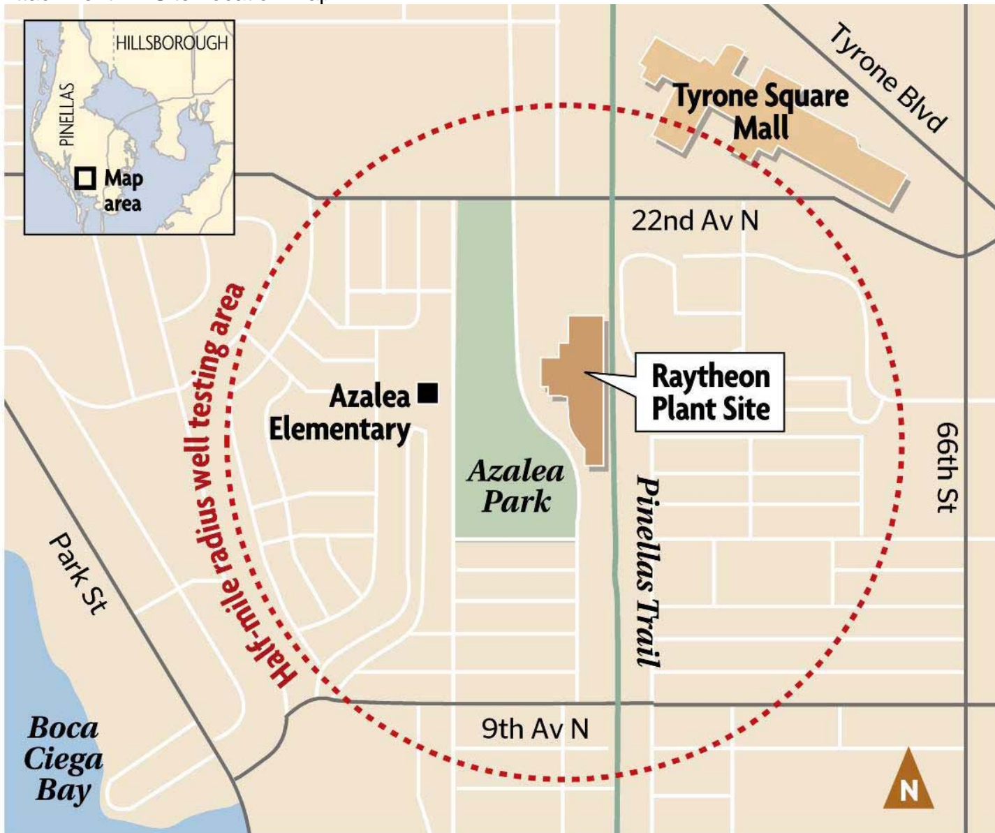
Attachment B: Site Location Map