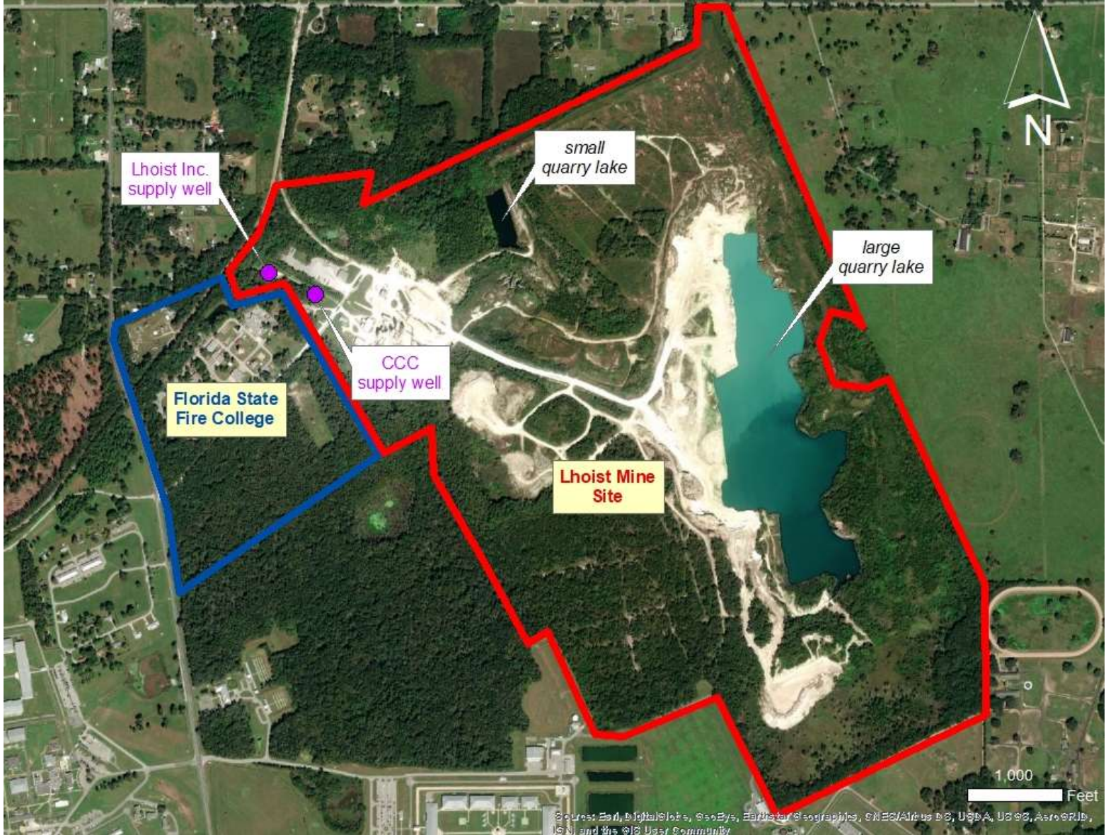
Figure 2: Lhoist Mine Site, Marion County, Florida.

Report 2 – Off-site investigation of per- and polyfluoroalkyl substances (PFAS) in groundwater at the Lhoist Mine Site