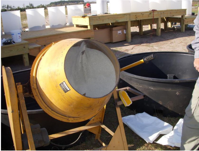
Mixing Media (Clinoptilolite 8X14 and Oyster Shell)