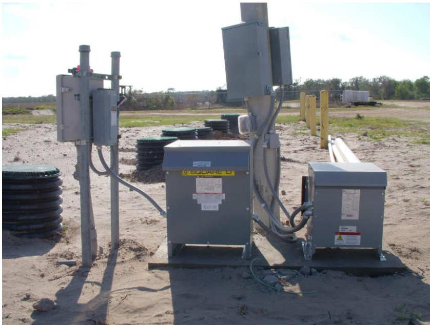
New Electrical Transformers