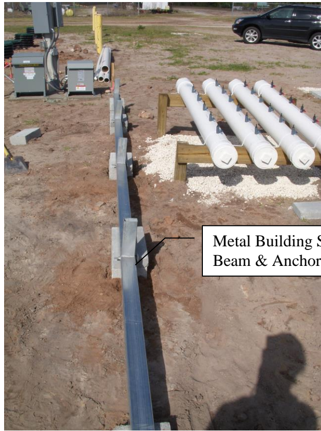
Metal Building Support Beam & Anchors