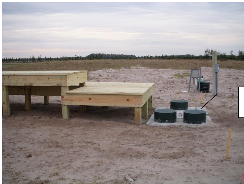
1050 Gal. STE Storage Tank #1