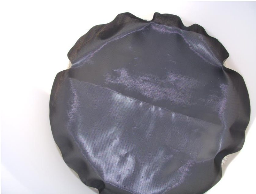
Installing Geotextile Fabric above Gravel at Bottom of Tanks