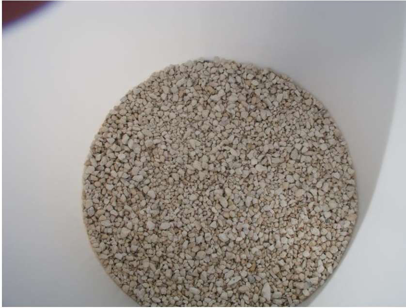
Gravel at the Bottom of the Tanks