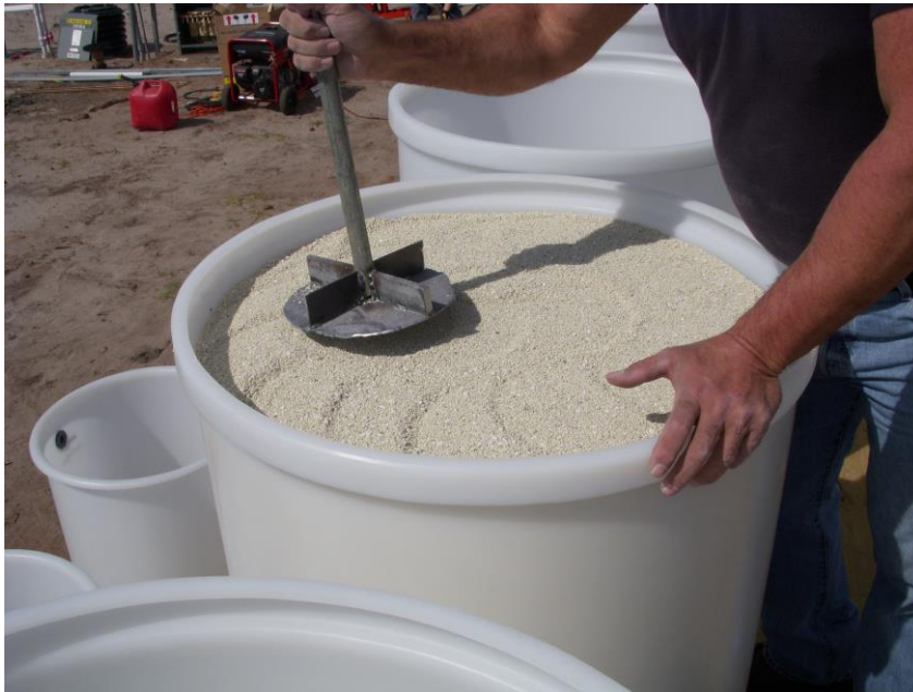
Tamping Media (UNSAT-CL-3)