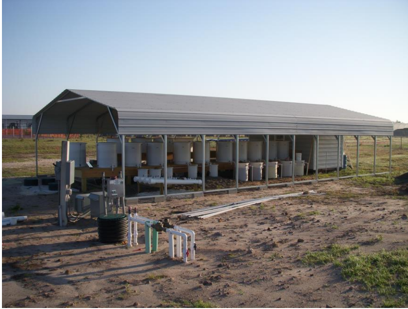
PNRS II Test Facility