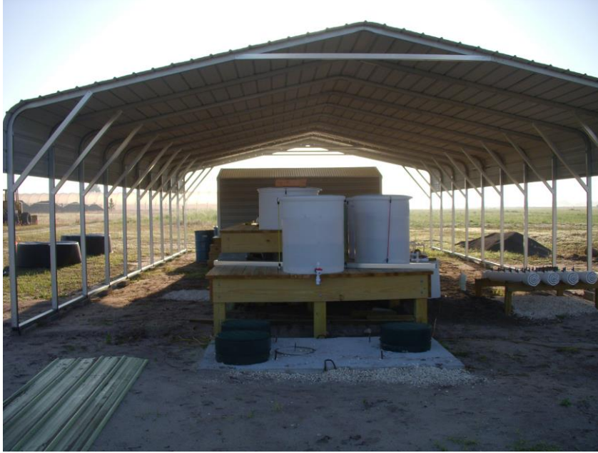
Metal Building Support Beams Almost Complete