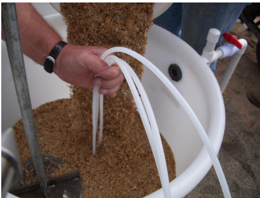
Installing Sample Piezometers within Stage 2 Upflow Tank (DENIT-LS-2)