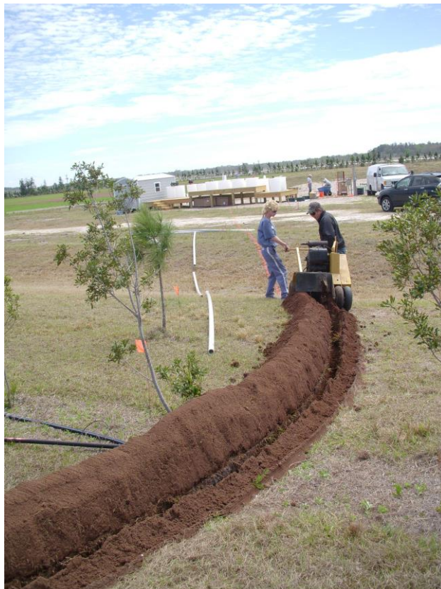
Installing Potable Water Line