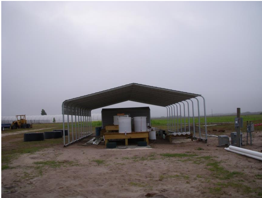
Metal Building Roof Panels Almost Complete