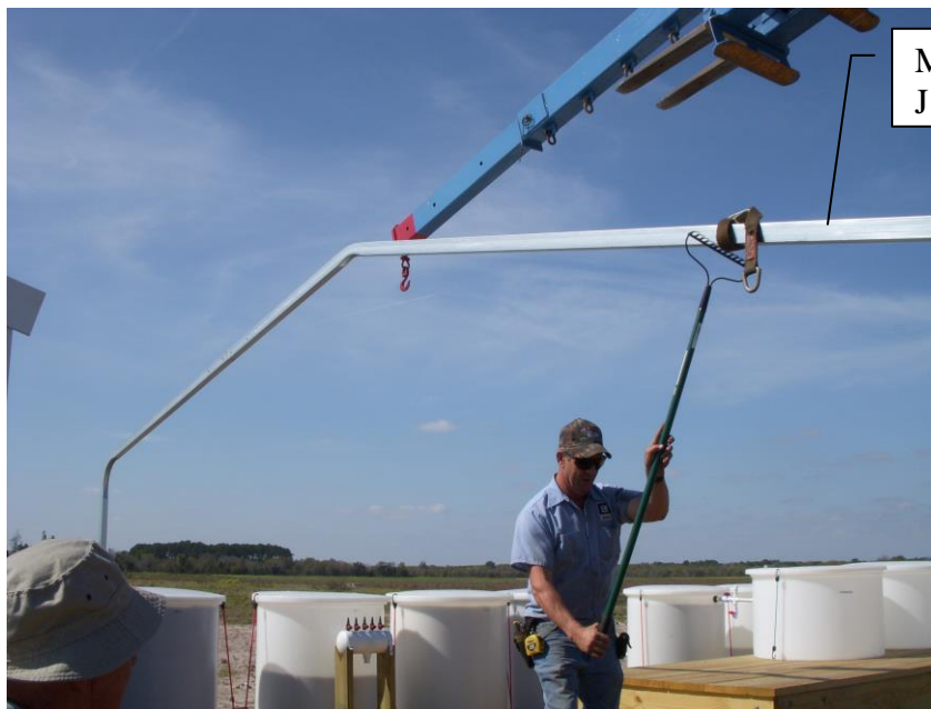
Metal Building J Frame