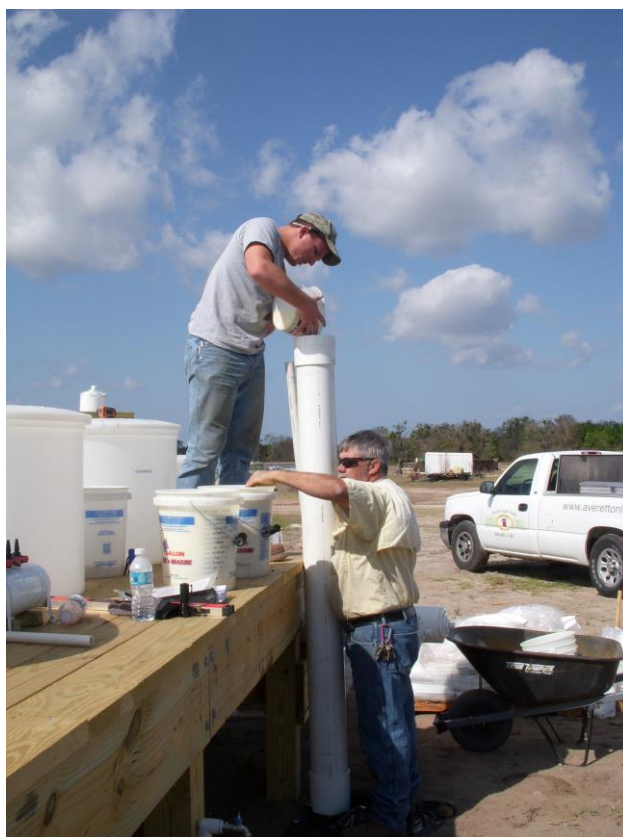
Installing Media within 6" x 72" L Stage 2 Filters (DENIT-SU-1)