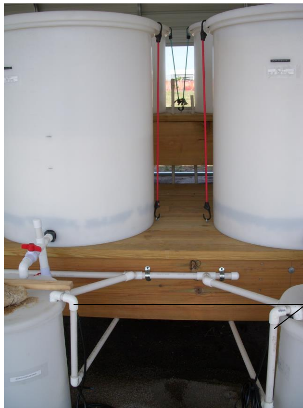
Recirculation Pumps and Pipe Installed