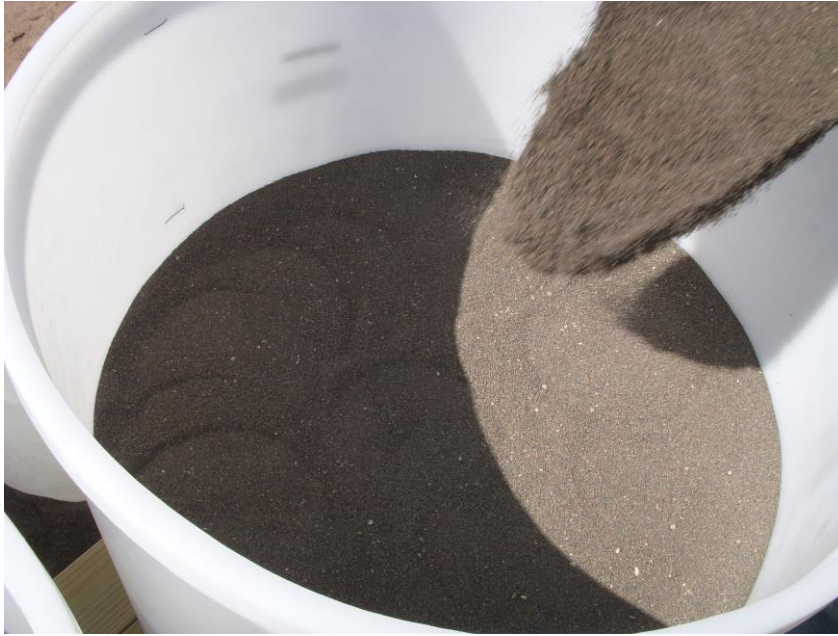
Installing Media in Tank (UNSAT-EC-3) above Geotextile Fabric