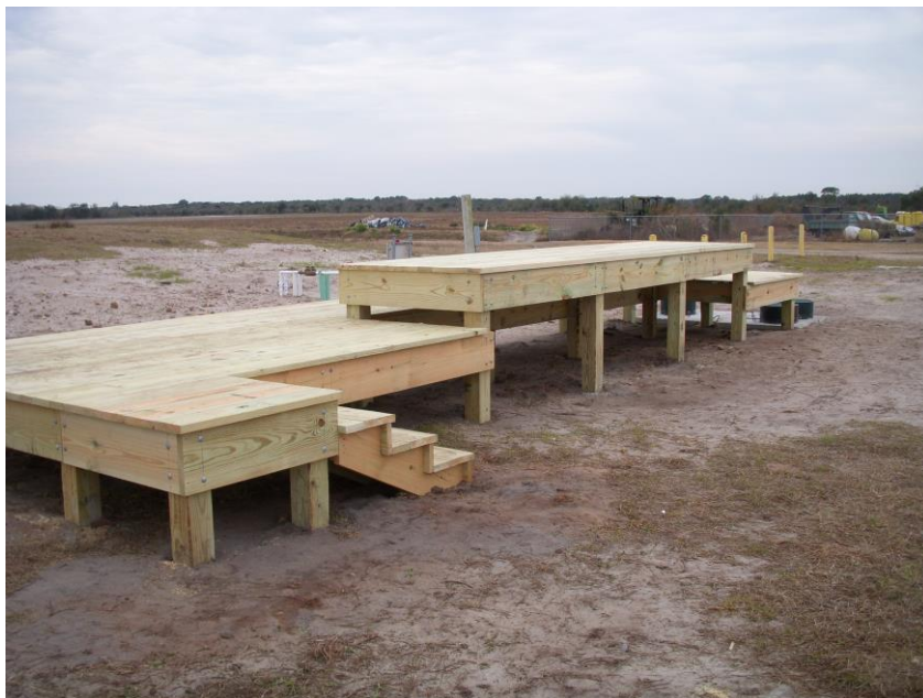
Wooden Platform North Side