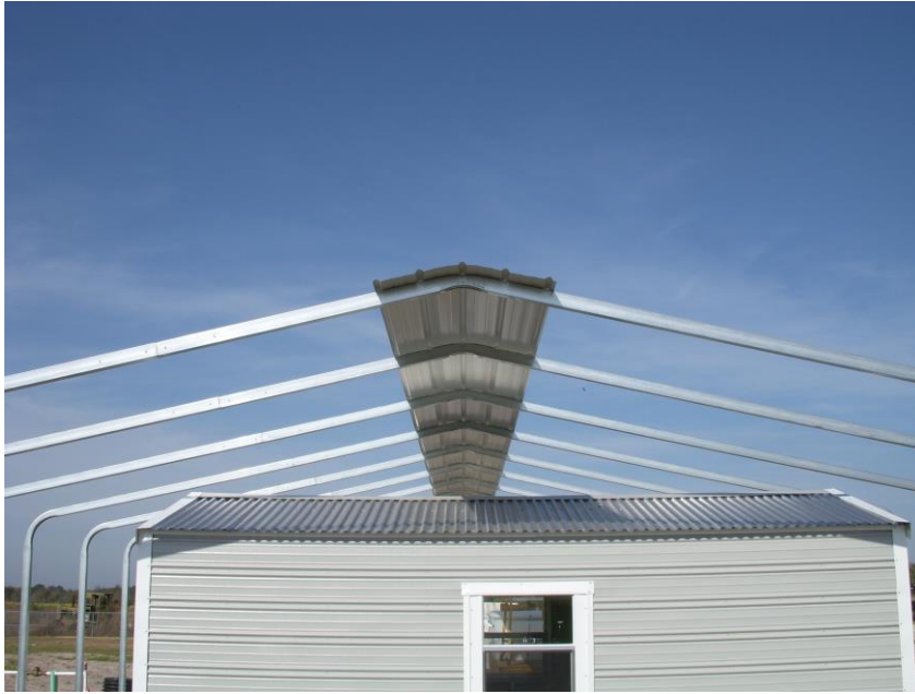
First Roof Panel Installed