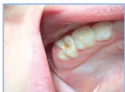
Before SDF Application