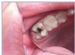
After SDF Application