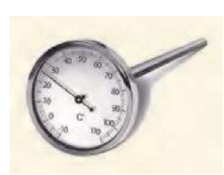
Bi-Metal Stem Thermometer