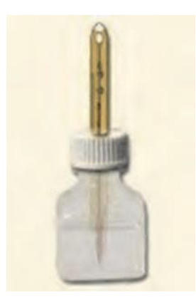
Fluid-Filled Bio-Safe Liquid