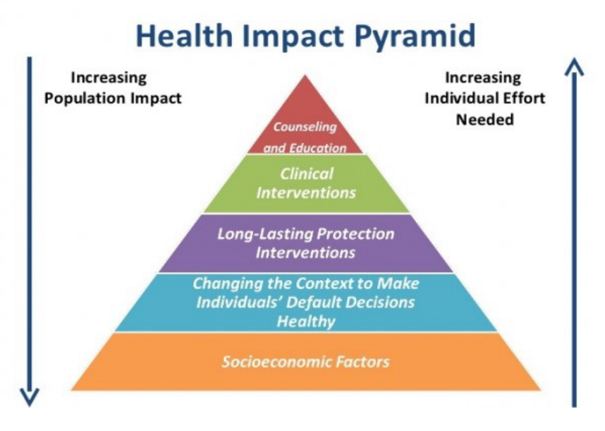
FIGURE 4: HEALTH IMPACT PYRAMID

Source: Frieden, T.R. (2010). A framework for public health action: The health impact pyramid. American Journal of Public Health , 100(4):590-595. Retrieved April 4, 2023 <a href="https://www.ncbi.nlm.nih.gov/pmc/articles/PMC2836340/">https://www.ncbi.nlm.nih.gov/pmc/articles/PMC2836340/</a>