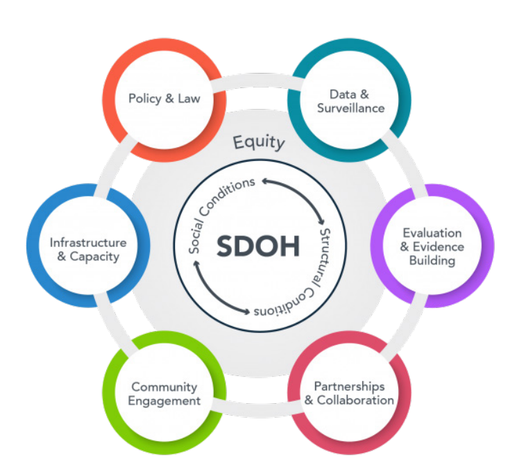
FIGURE 3: SOCIAL DETERMINANTS OF HEALTH (SDOH)